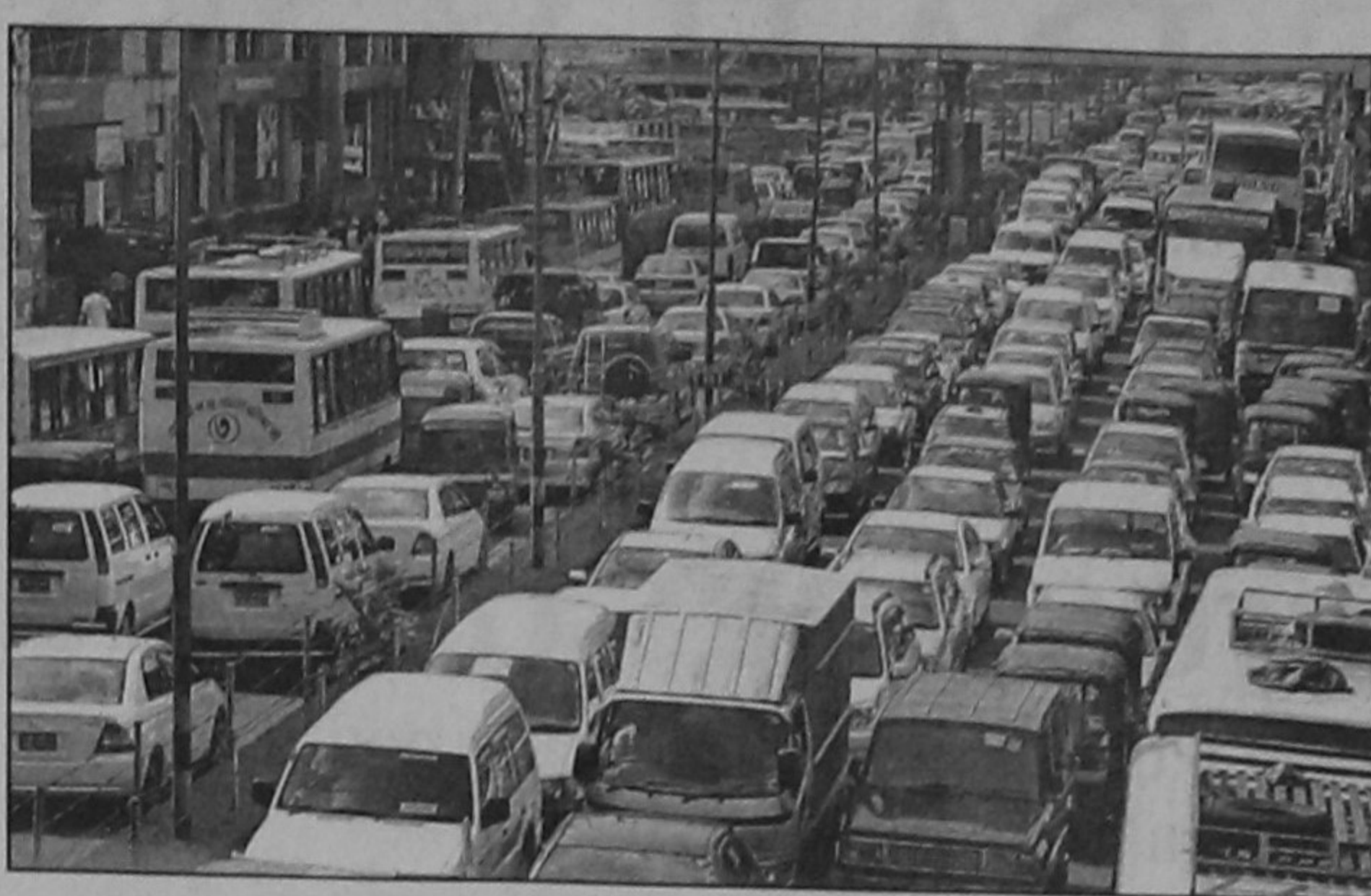
Hundreds of vehicles get stuck in gridlocks on different roads in the city yesterday, causing immense suffering to commuters. The picture was taken from in front of Hotel Sonargaon.

On the occasion, Qurankhwani and milad mahfil will be held at her village home today.