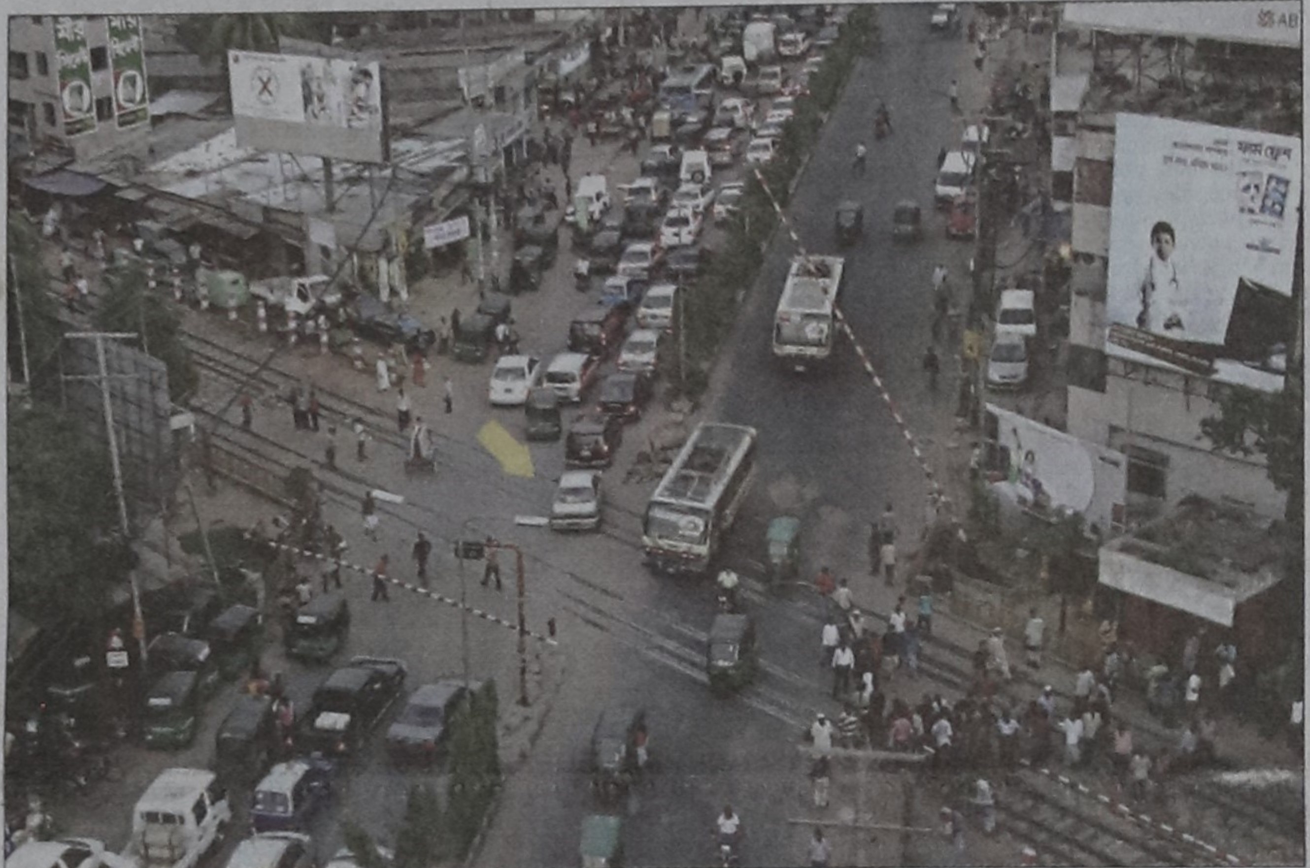
A day after a train reduced four vehicles to scrap at Moghbazar level crossing, this car became stranded on the railway lines at the same spot due to a traffic jam.

JS DISCUSSION District-wise budget, low GDP growth target slated