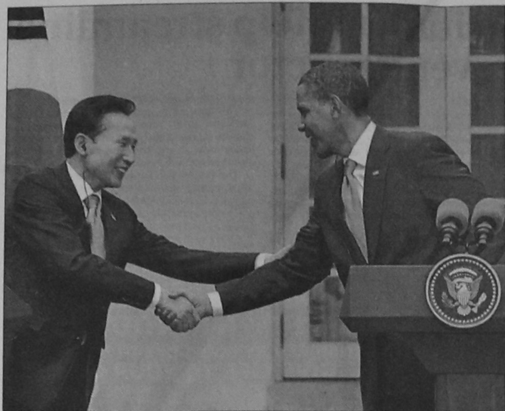
US President Barack Obama shakes hands with South Korean President Lee Myung-bak during a press conference in Washington on Tuesday.