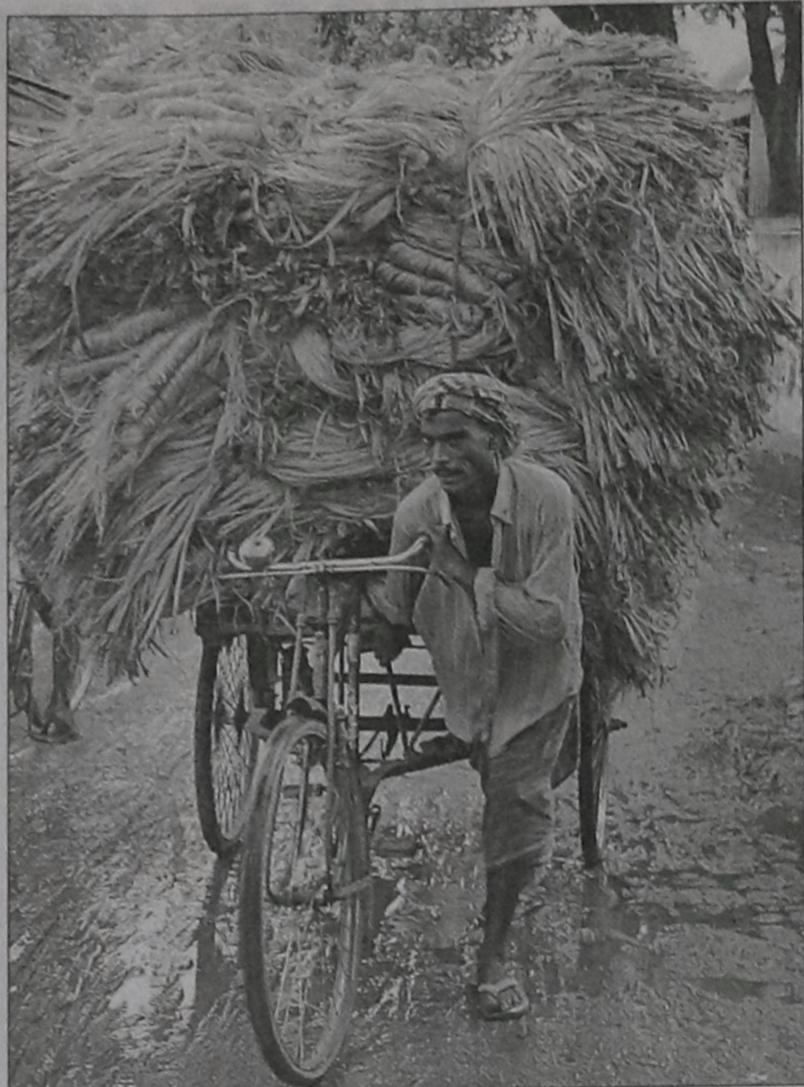
an official said.

"But the minister said raw jute exporters can make deliveries to the supplies when jute harvest begins,"