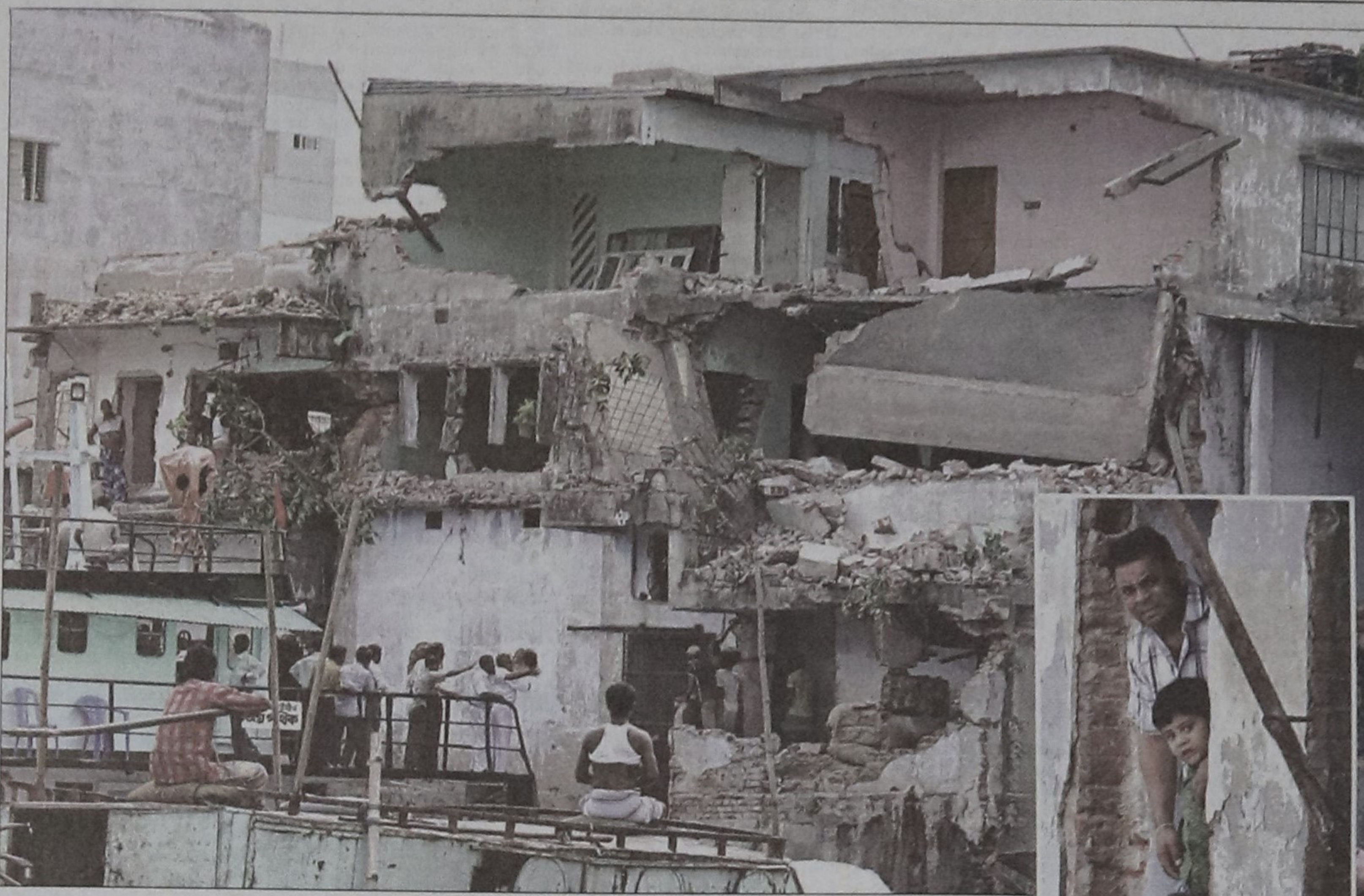
BIWTA along with the district administration knocks down illegal structures on the Shitalakhya in Narayanganj yesterday. Inset, a father and son watch the demolition drive that also razed part of their house.