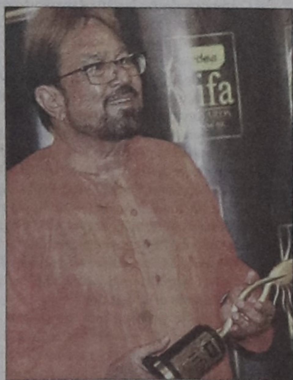
Rajesh Khanna was honoured with the Lifetime Achievement Award.

The movie's lead man, Hrithik Roshan, took Best Performance in a Lead Role (Male), urging his fans among the 8,000 gathered at the Venetian Macao Resort-Hotel to "have the courage