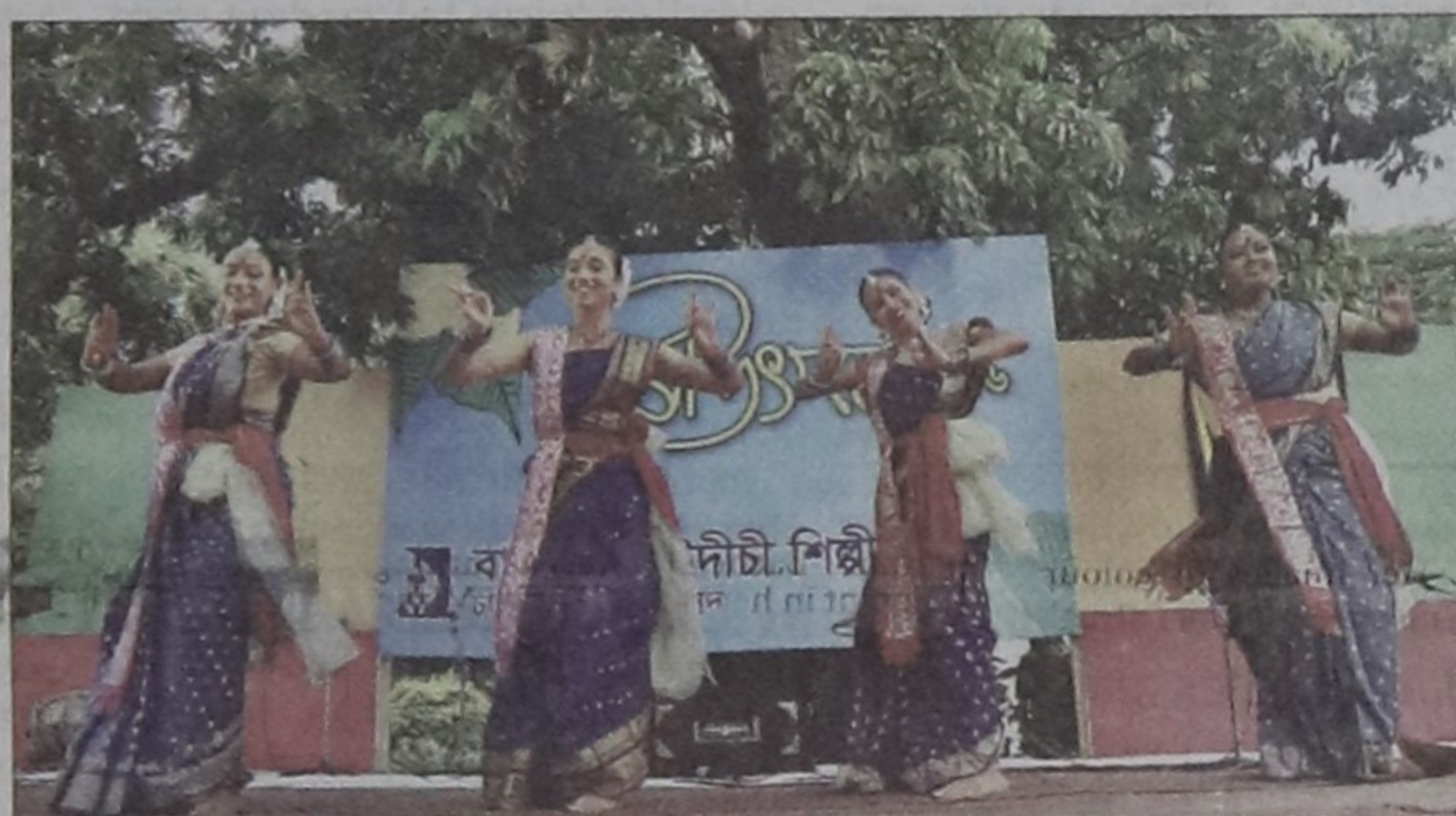
Artistes celebrate the first day of monsoon season with music and dance at Udichi's programme.