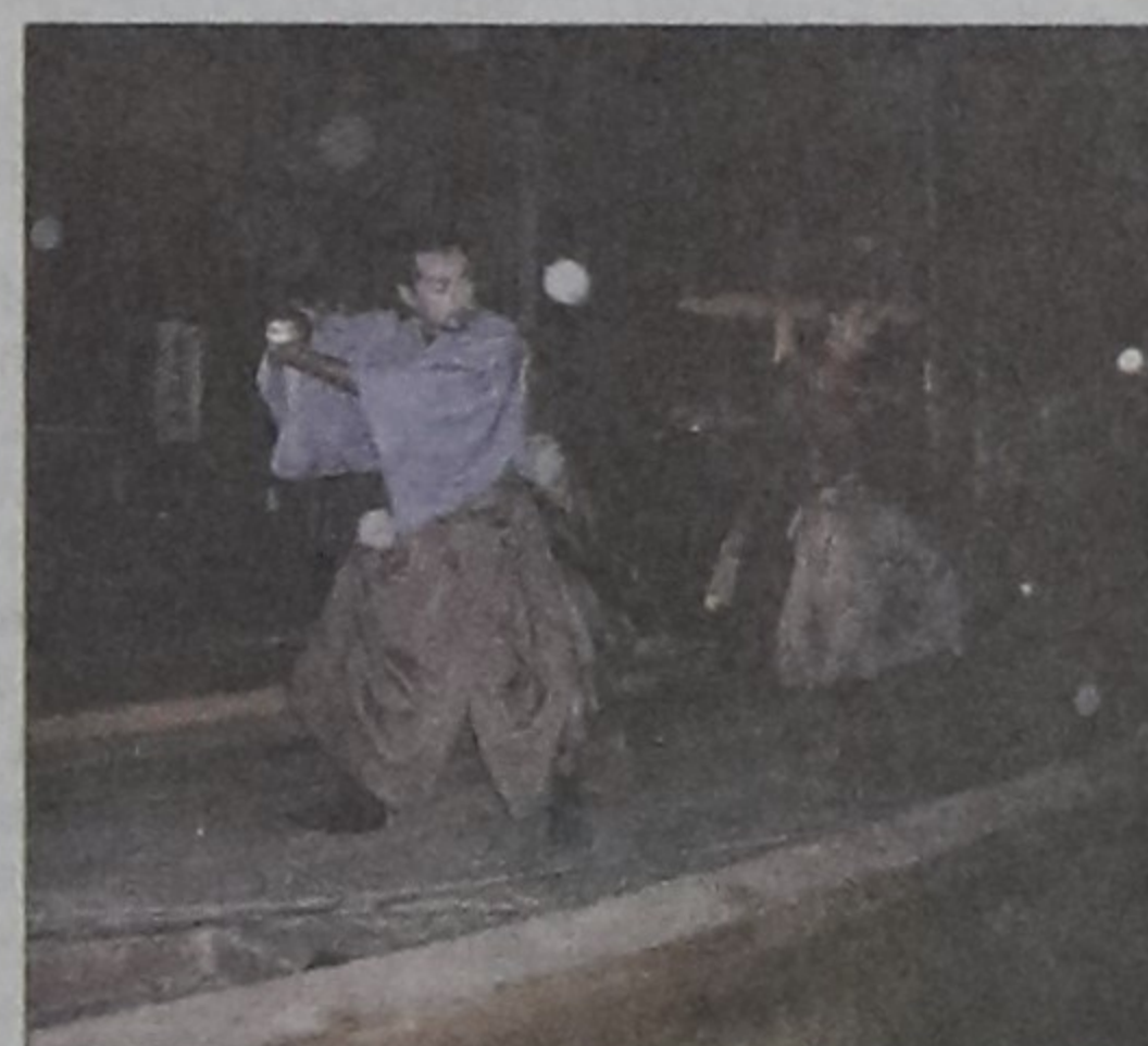
A scene from "Eksho Bosta Chal."