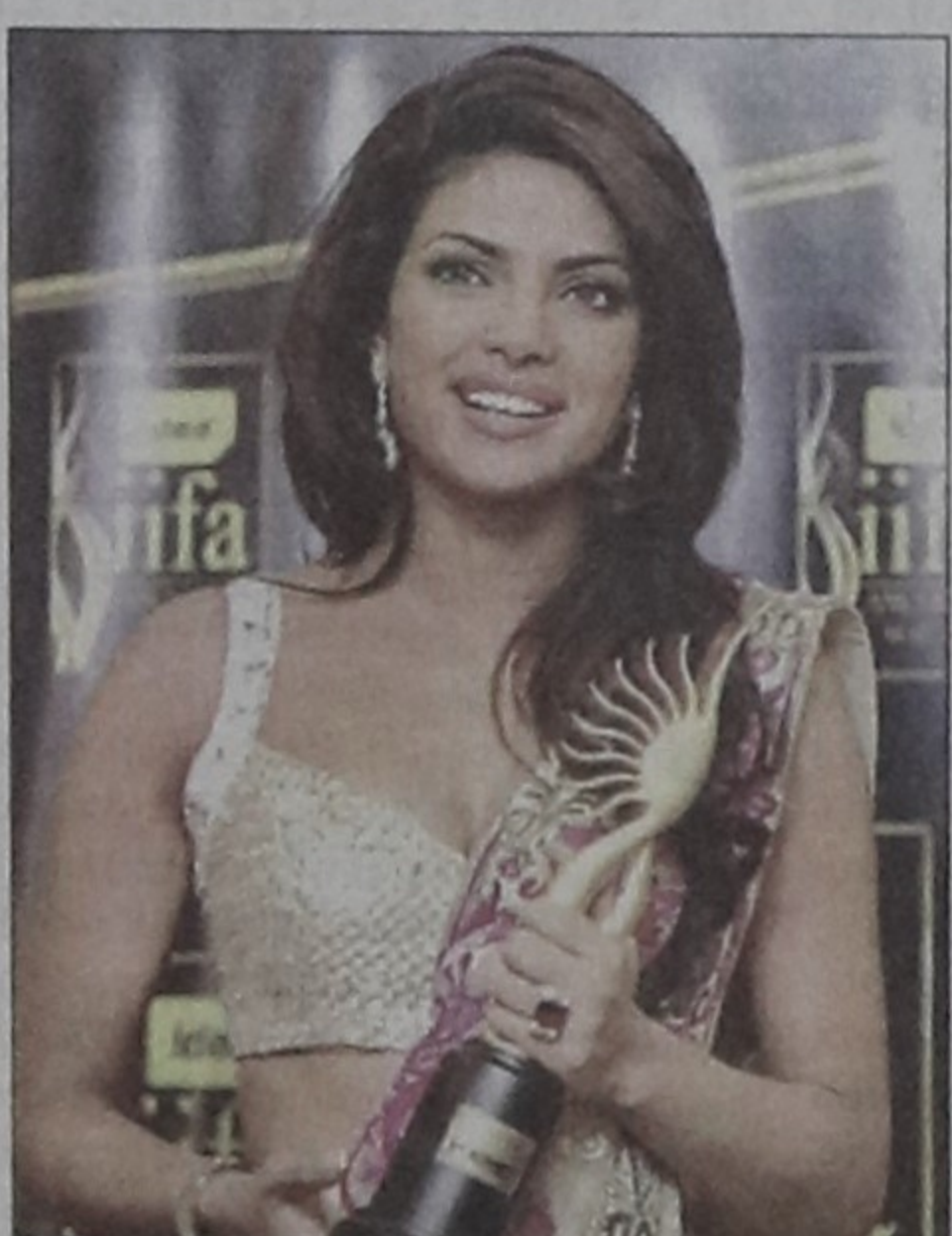
Priyanka Chopra looks at ease with the Best Actress award.

to live free and live the truth." Former Miss World Priyanka Chopra, whose effort as a model dealing with the seedy side of the business in "Fashion" won her Best Performance in a Lead Role (Female), thanked the audience for sitting through the nearly seven-hour ceremony.