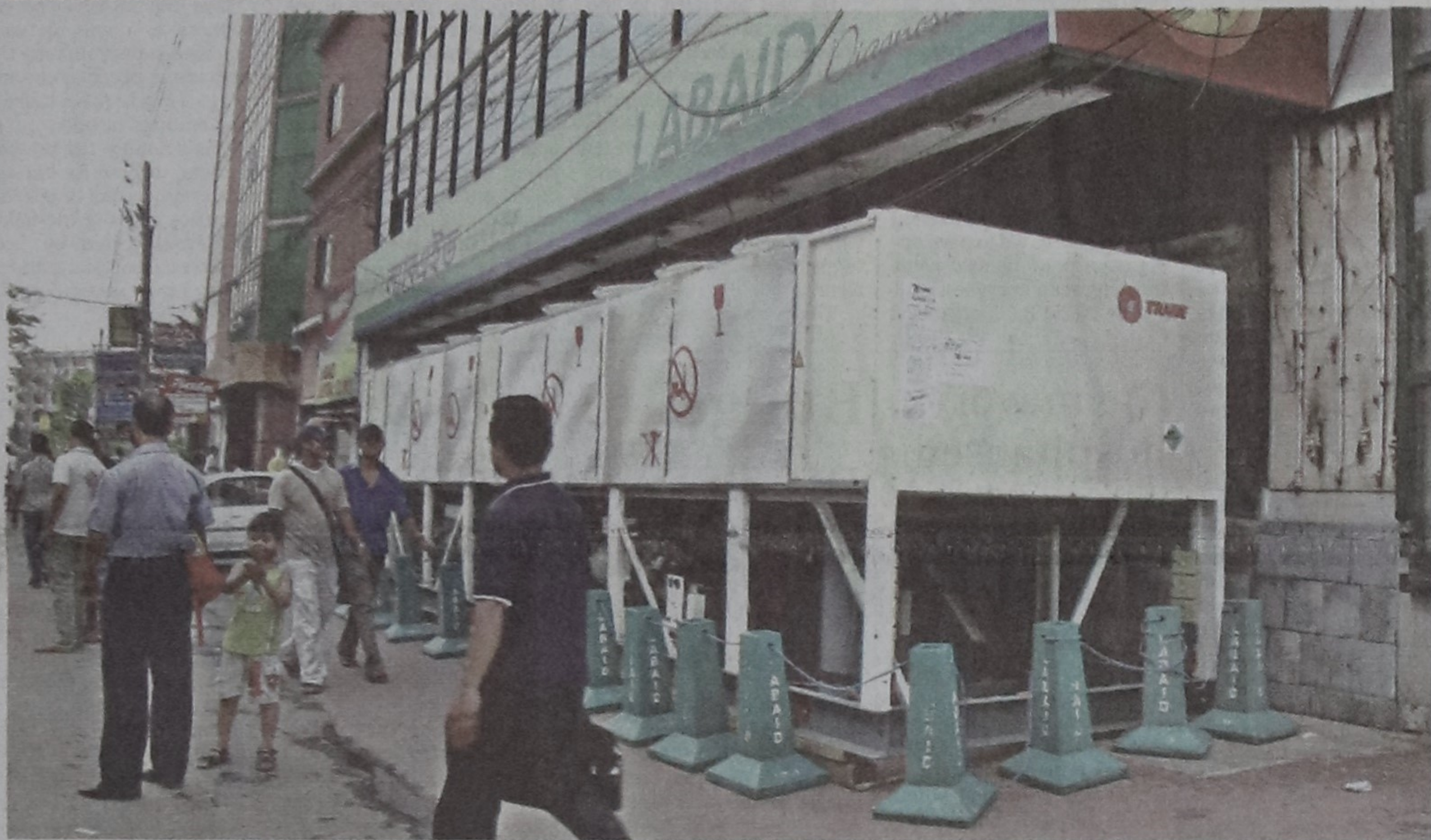
An air-conditioning unit of LabAid Diagnostic Centre occupying a part of the pavement along Green Road forces pedestrians to make a risky detour. LabAid authorities claim the seven-tonne device is waiting on their land to be lifted to the top floor. Usually, roads and pavements in the capital are under Dhaka City Corporation.