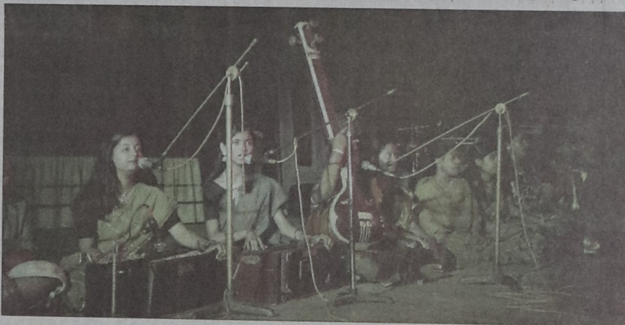
Artistes of Sirajganj sing at the event.

Cultural programme by Sreekamol Sangeet Biddyalay