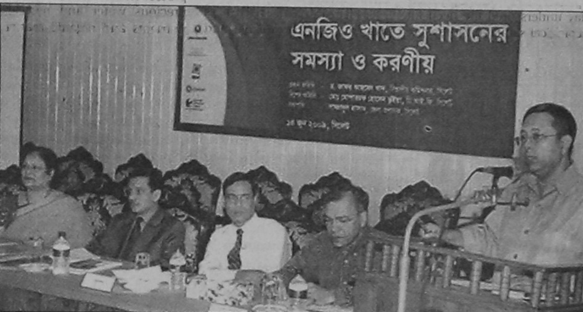
Sylhet Divisional Commissioner Dr Zafar Ahmed Khan speaks at a view exchange meeting on 'Problems regarding good governance in NGO sector and its solutions' at Sylhet Zila Parishad auditorium yesterday.

The deputy commissioner suggested setting up division level offices of NGO Affairs Bureau to strengthen the monitoring of NGO activities.