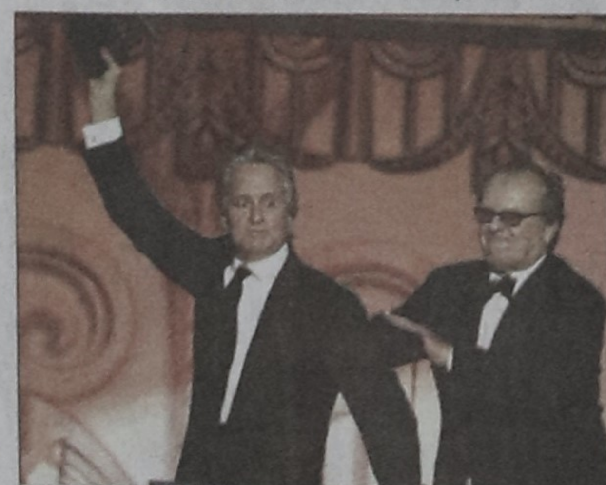
Michael Douglas and Jack Nicholson.