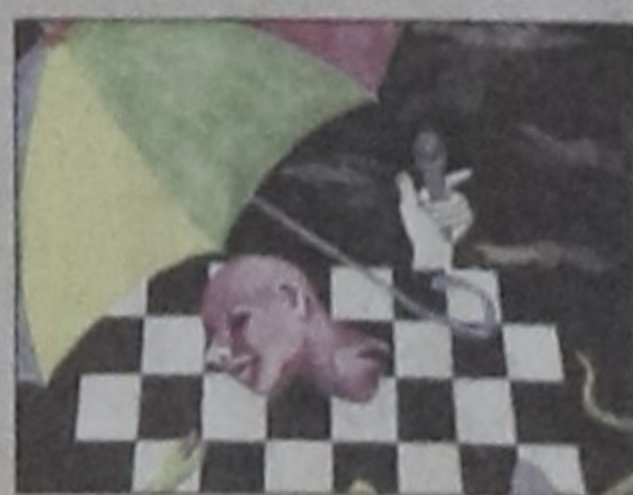
Photo Exhibition Title: The Art of Photography: Portraits Organiser: Pathshala, South Asian Institute of Photography Venue: Galerie Zoom, Alliance Francaise Date: June 11-24 Time: 9am-12pm and 5pm-8pm (except Saturdays)