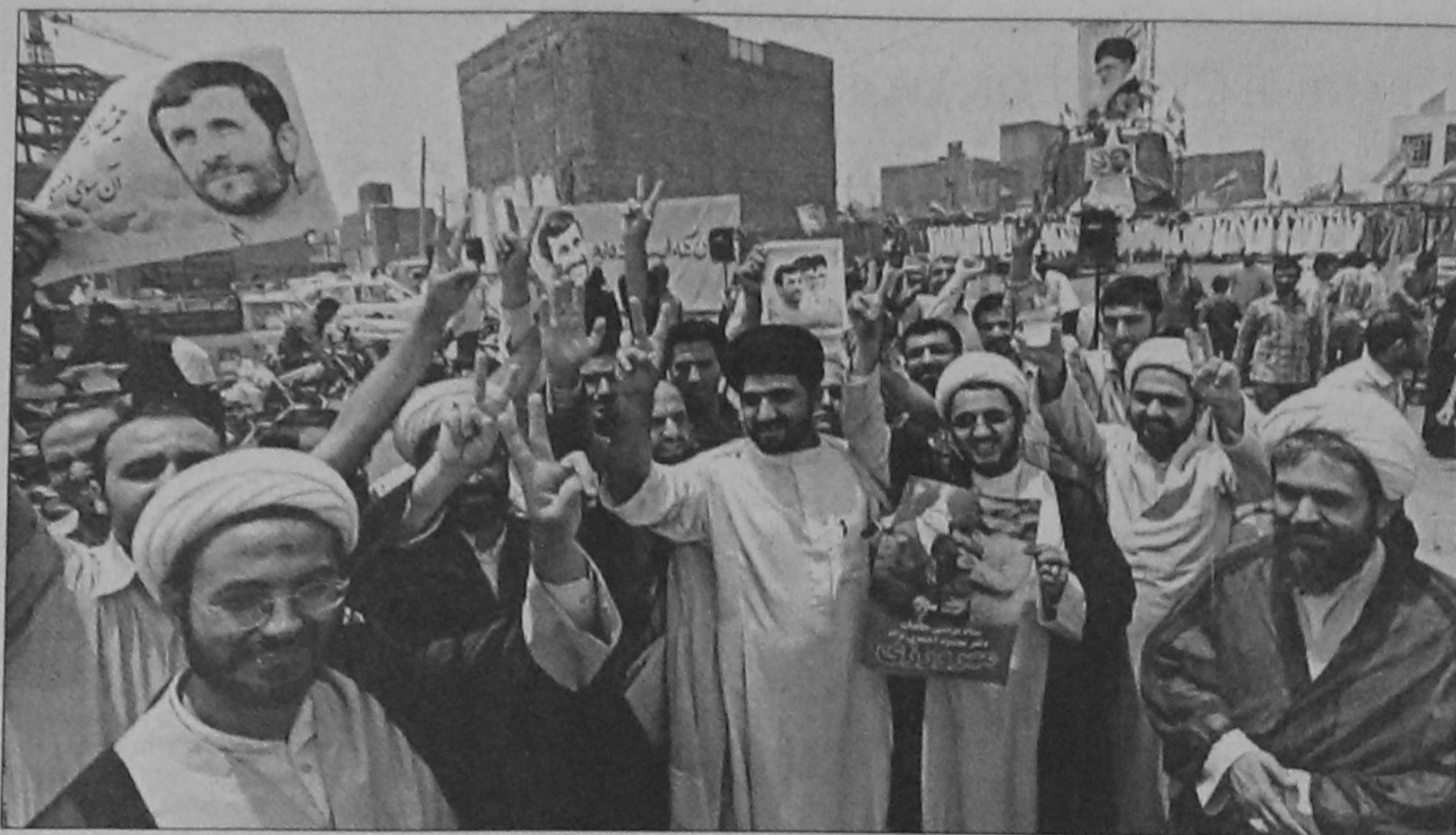
Iranian clerics, carrying portraits of Iranian President Mahmoud Ahmadinejad (L) and supreme leader, Ayatollah Ali Khamenei, flash the V-signs as locals celebrated the incumbent president's landslide victory in the Islamic republic's most hotly contested presidential election yesterday in the Shia holy city of Qom, 120km south of Tehran.