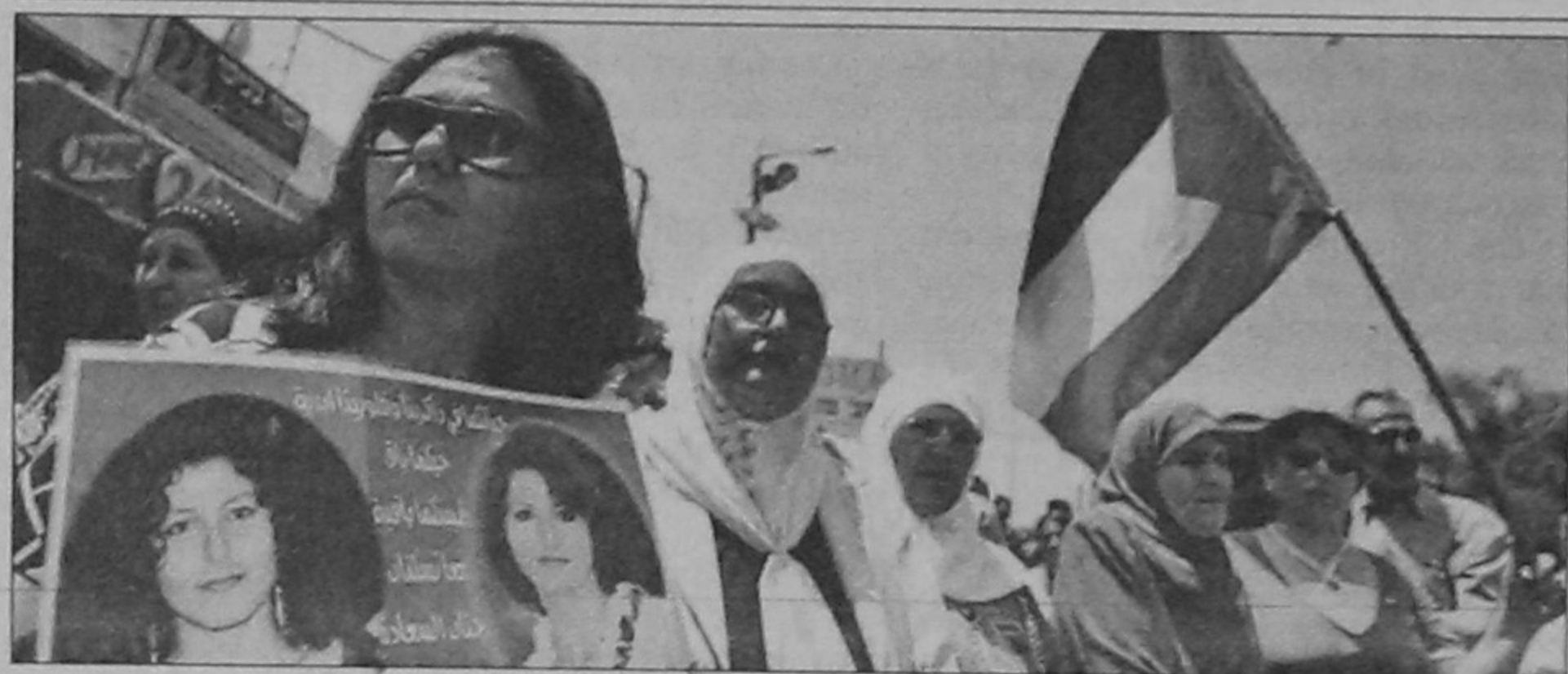
Around 250 people, some holding up Palestinian flags, protest in the northern Israeli town of Shfaram yesterday against the indictment of 12 Israeli Arabs for lynching an Israeli soldier after he opened fire on a bus and killed four people in a deadly rampage four years ago.

"We are well aware of the many difficulties that lie ahead. Yet we share an obligation to create conditions for negotiations to begin promptly and end successfully," Mitchell said.