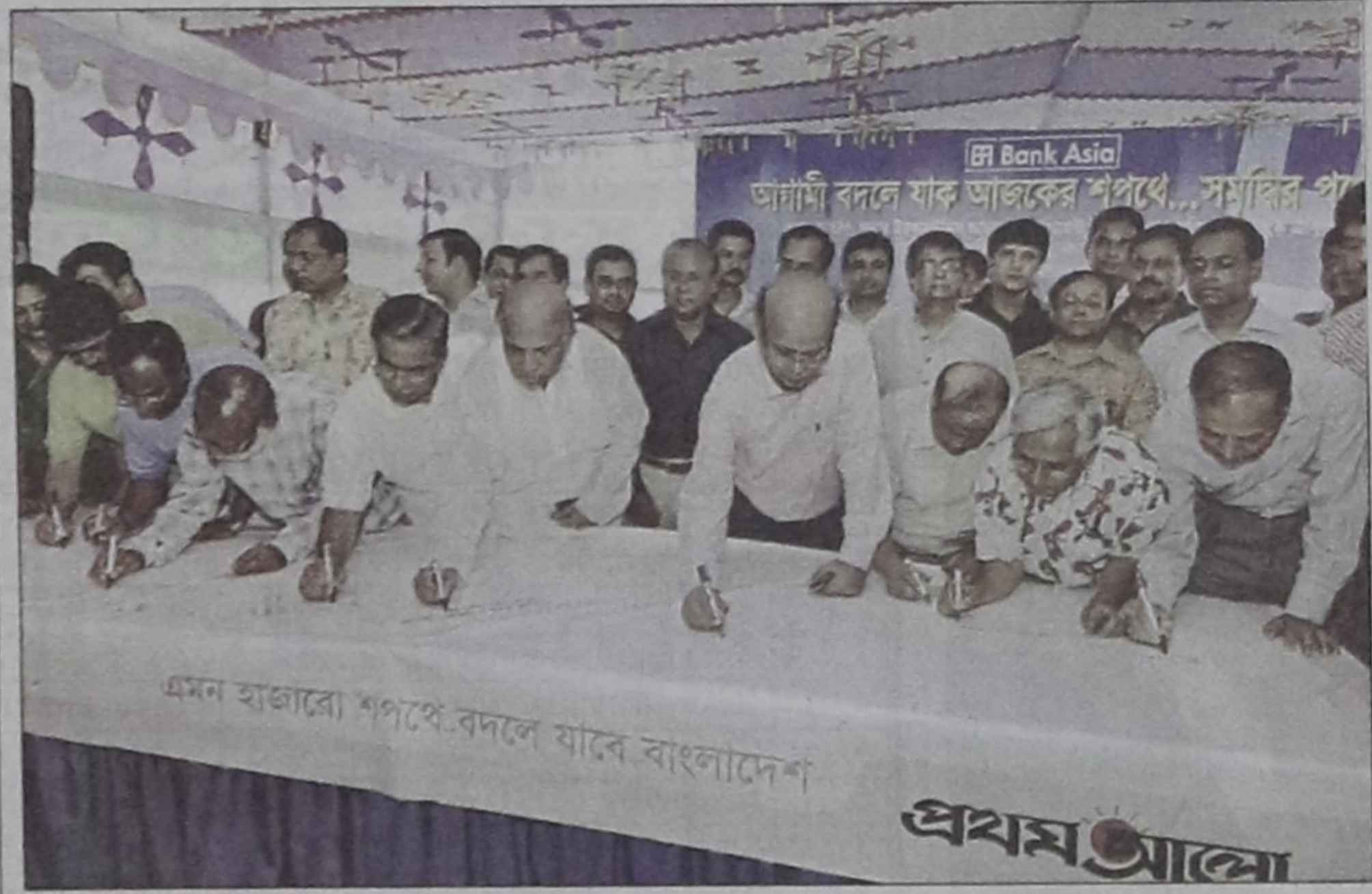
Bank Asia officers and executives write their pledges to change themselves on a banner on its Scotia Branch premises in the city yesterday as part of the 'Bodle Jao, Bodle Dao' (Change yourself, change others) campaign of the daily Prothom Alo.