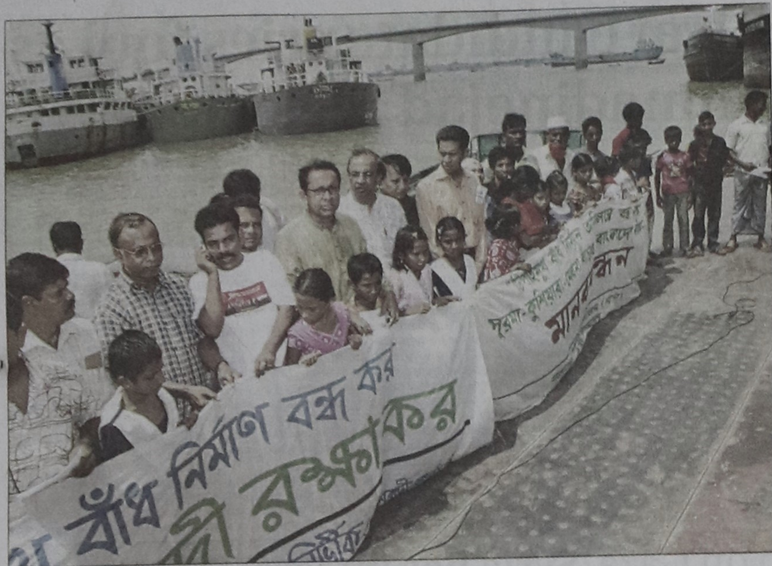
Bangladesh Paribesh Andolon (Bapa) forms a human chain at Meghna Ghat at Sonargaon yesterday protesting the construction of Tipaimukh Dam and demanding steps to save the Meghna river.