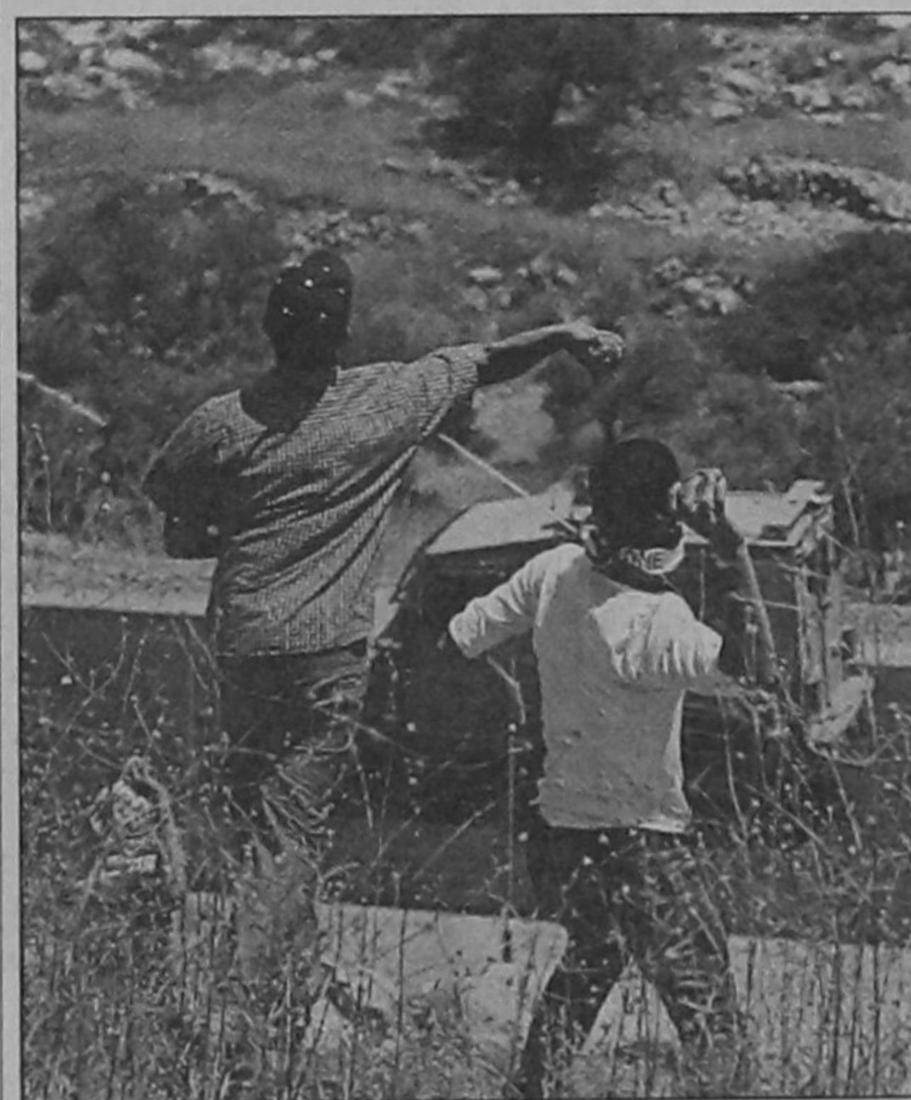
Palestinian youths throw stones at an Israeli military vehicle during a protest against the construction of the West Bank separation barrier in the village of Nilin, near Ramallah yesterday.

"At the same time, they're sending in a relatively modest level of weapons and capabilities to attack Isaf (International Security Assistance Force) and coalition forces.