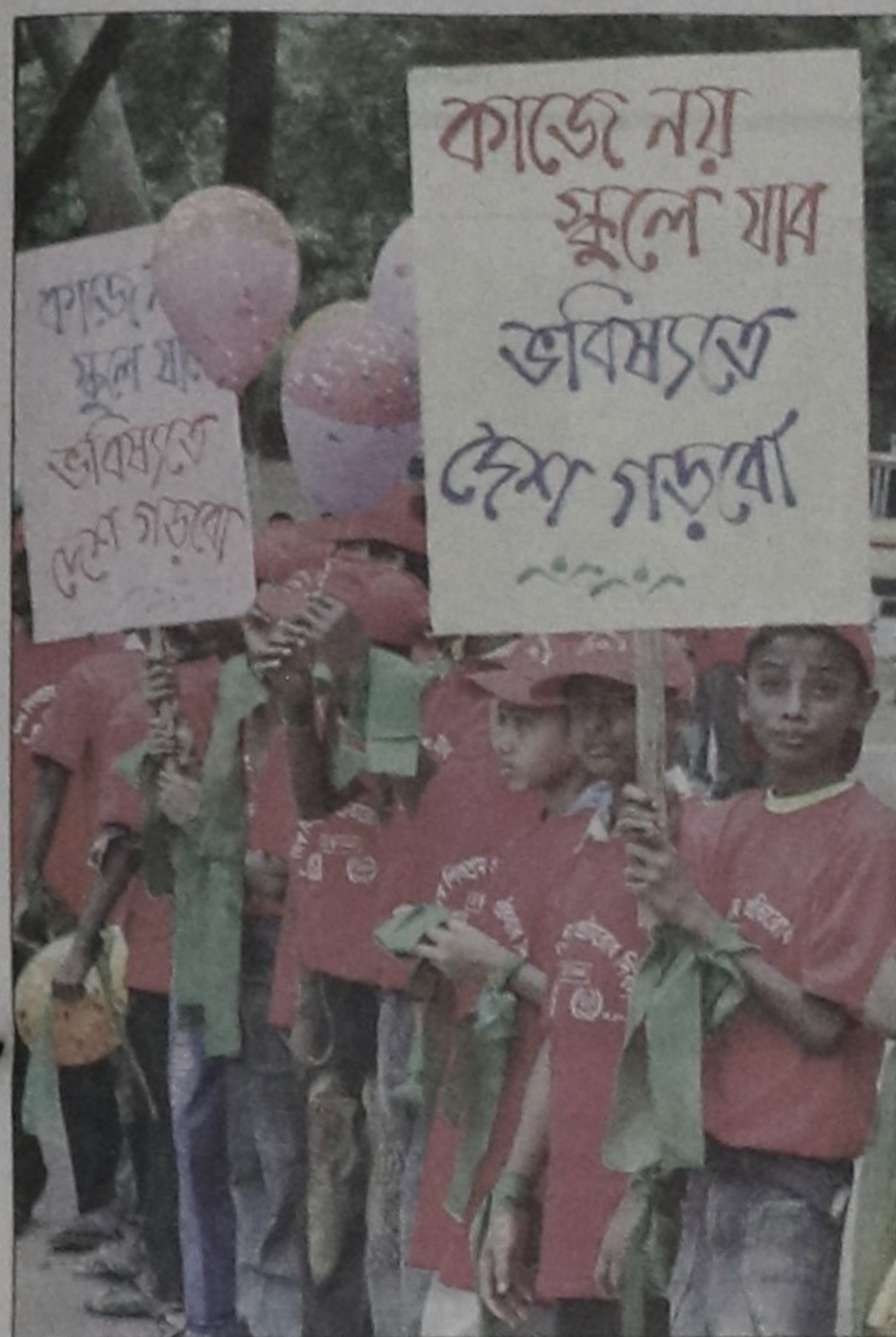
Children carry placards with pledges to go to school – not to work – to groom themselves to contribute to the nation-building in future, as they take part in a procession in the city yesterday. Bangladesh Institute of Labour Studies organised the procession to mark the World Day against Child Labour. (Story on Page 2)