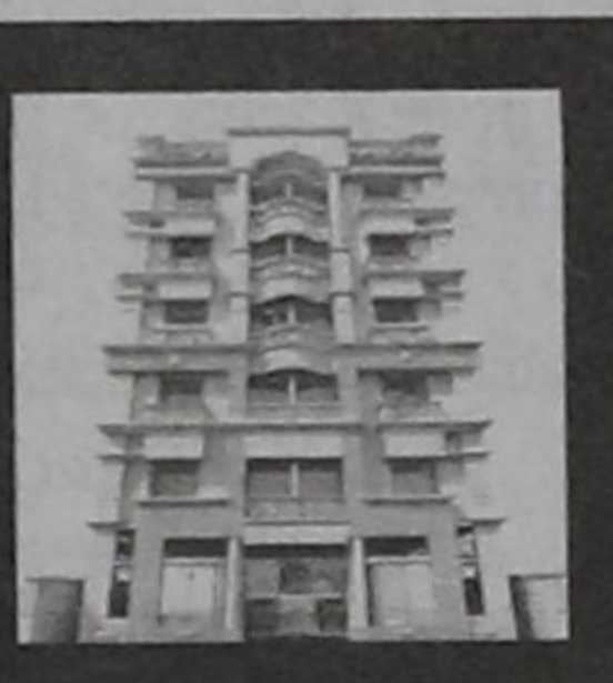
Plot - 184 Lane - 21, [ 1400, 1425 & 2825 sq ft ]

GENETIC LIMITED House # 19, Road # 49, Gulshan - 2, Dhaka 1212 Phone : 8834038, 8834094, 8834114, 8834203, 8814551, 8824254, 8825150, 8833832, 9891305; Cell: 01720502436, 01720502437, 01720502439, 01720502441 Fax: +88-02-8825941, E-mail: info@geneticlimited.com