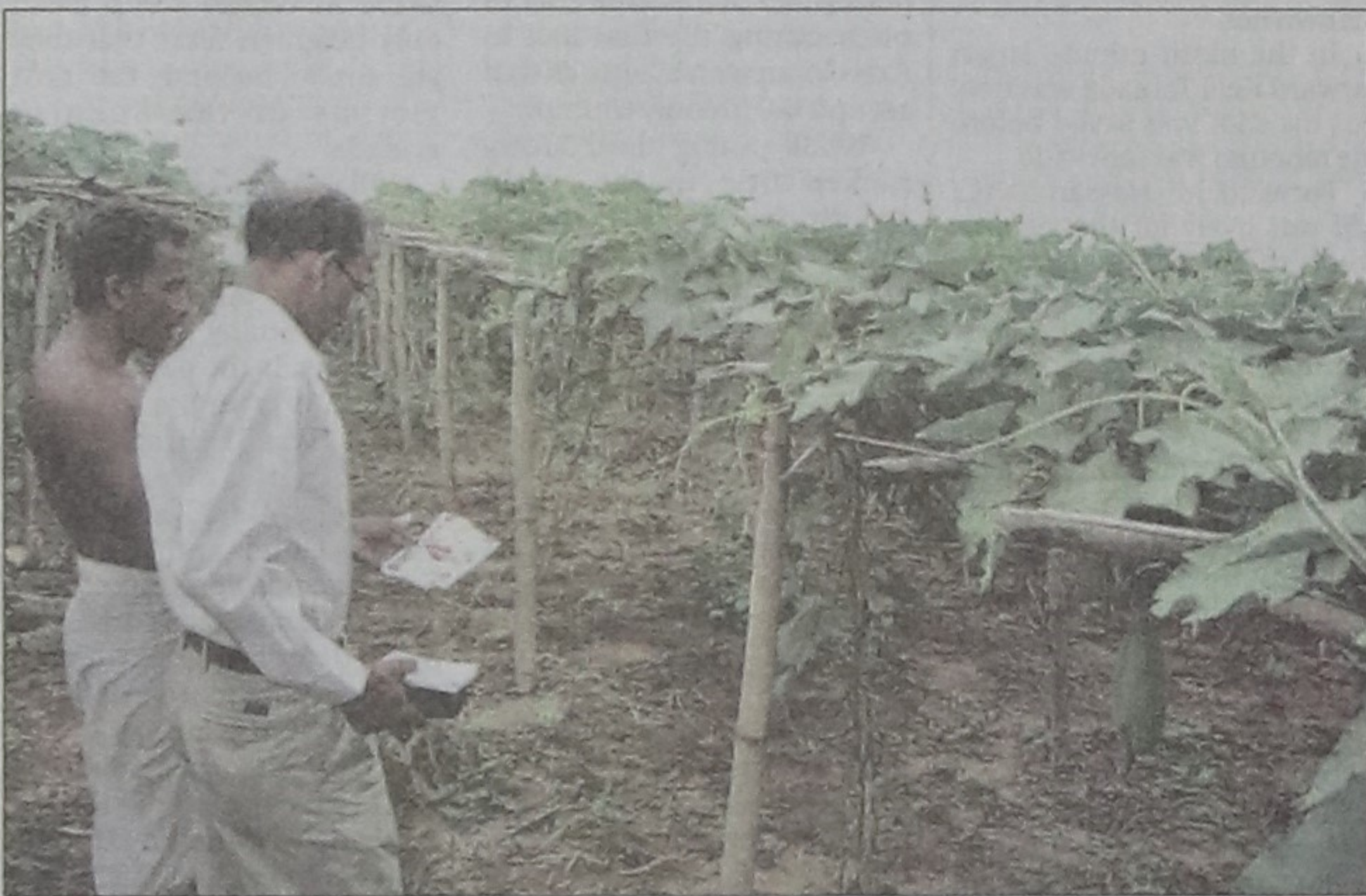
An agricultural researcher briefs a farmer at a vegetable garden on a hill slope at Adarsha Gram under Manikchhari upazila in Khagrachhari.

"The vegetables specially kakrol, bean, pumpkin, oram, garlic, ginger, snake gourd known as jhinga and lady's finger grown in bumper this year bringing smile on the faces of farm-