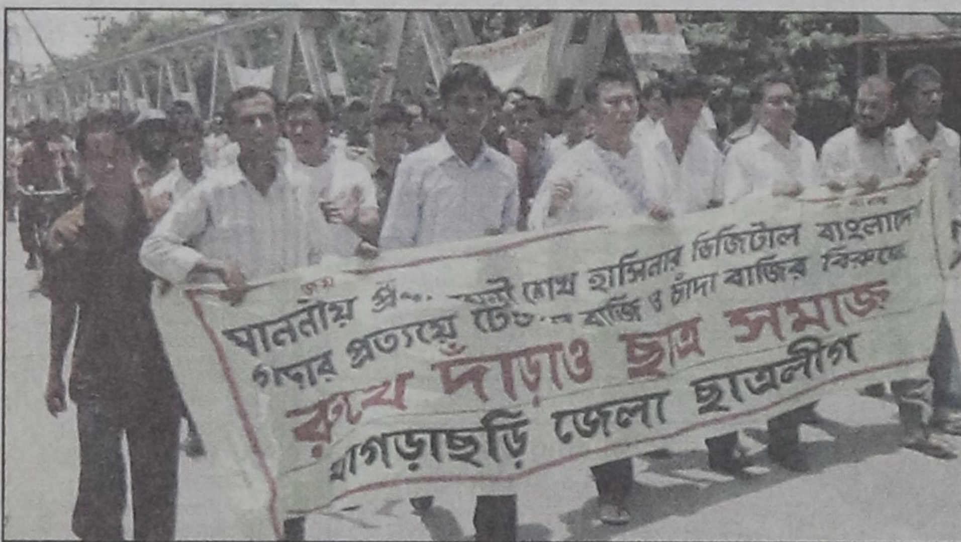
Bangladesh Chhatra League brings out a procession in Khagrachhari town yesterday protesting 'tender manipulation and extortion' by senior party leaders.

The judge also rejected the bail petitions of the accused submitted to the court through Advocate Quazi Mohatul Hossain.