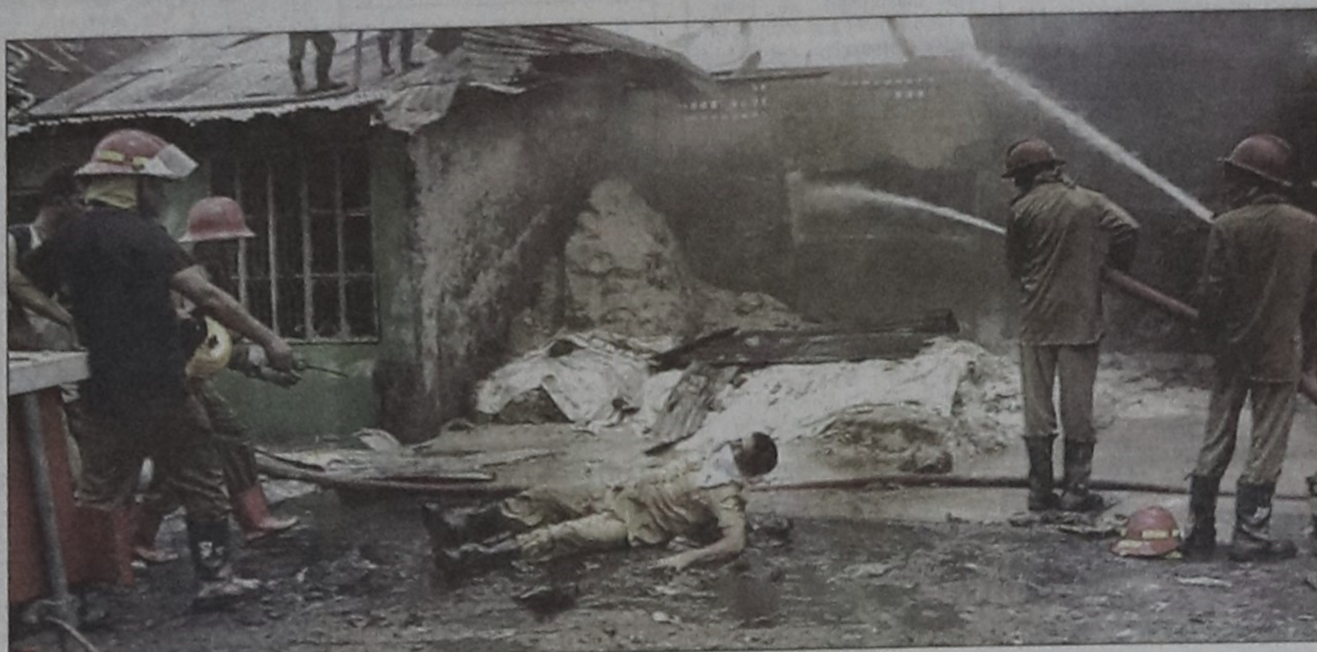
A fireman collapses after inhaling toxic smoke while trying to extinguish a fire at a chemical godown at Majhirhat in Chittagong yesterday. (Story on Page 16)