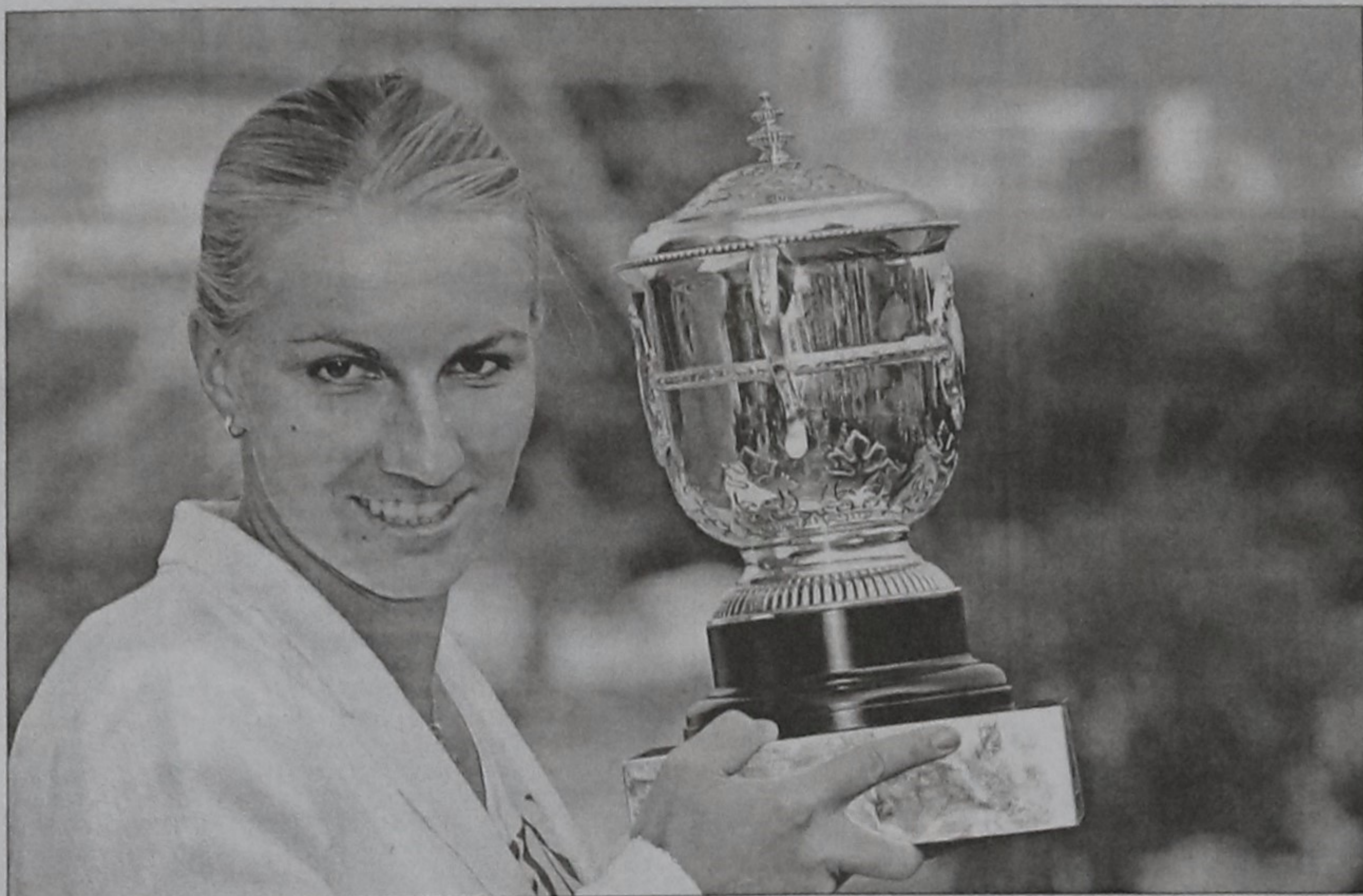
French Open winner, Russia's Svetlana Kuznetsova displays her trophy during a photocall in front of the Eiffel Tower in Paris on Saturday.