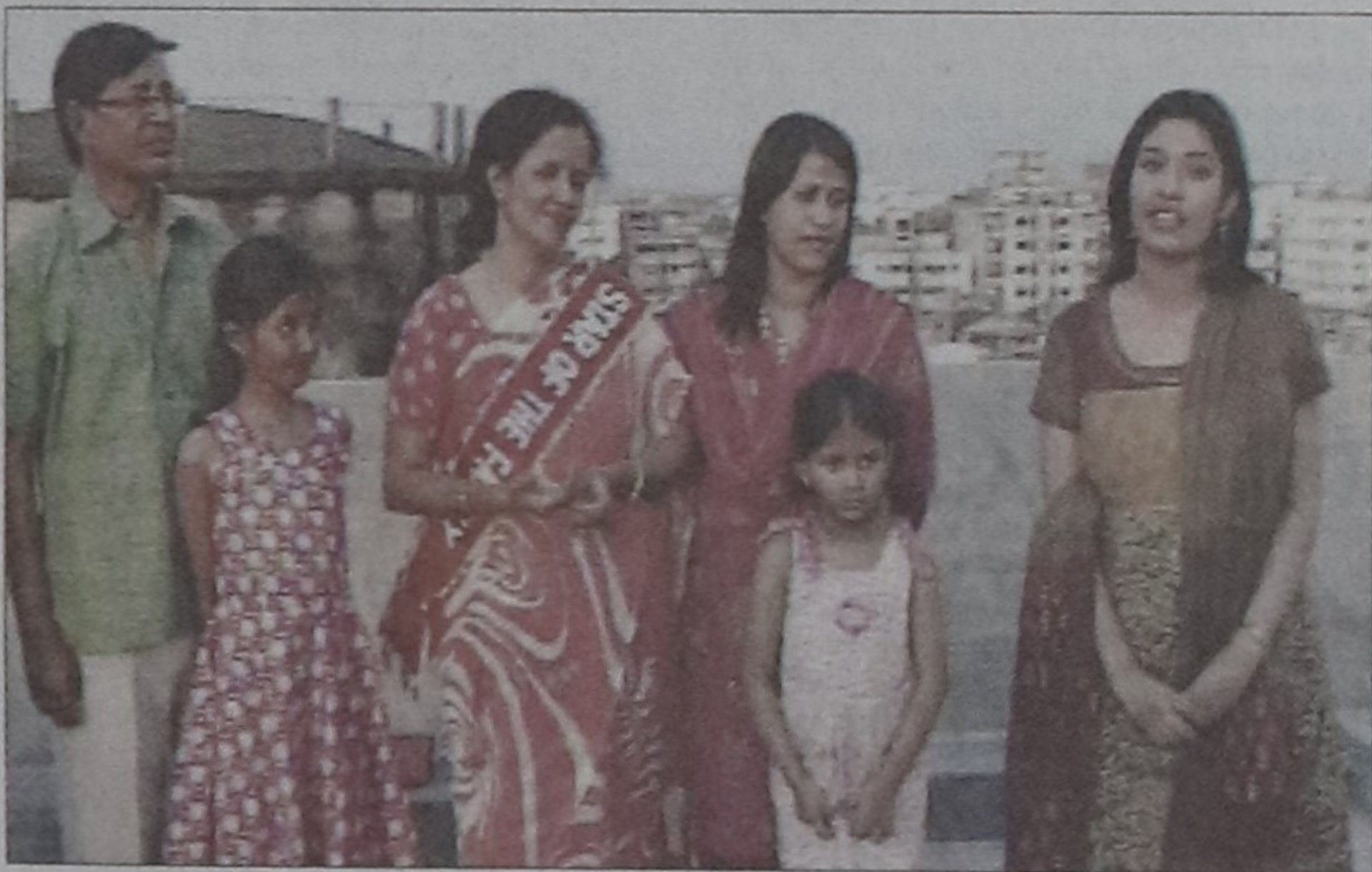
The game show will be aired on Ekushey TV tonight.

'Golla Chut' on household chores; 'Openti Bioscope' a quiz on bygone songs; 'Hatey Hari'- the flaws of family members; 'Panchamukhi' a round of self-admiration. The lucky winners of every round are to get a gift-hamper and a 'Star of the Family' would be nominated on the overall performance basis. The game show is geared for families across the country.