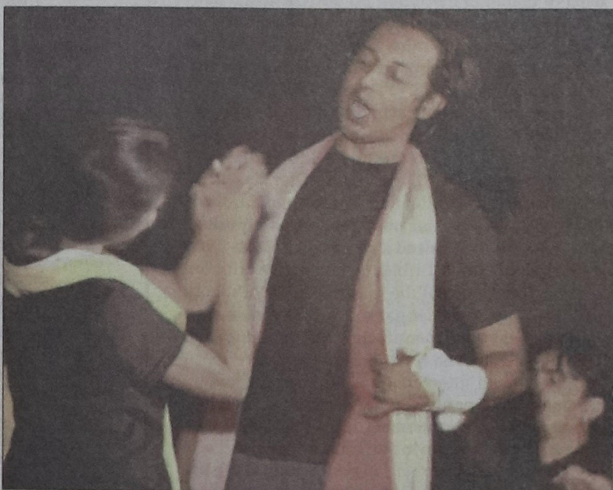
Centre for Asian Theatre (CAT), will stage a street play "Rupkumar- Julekhar Pala" at the Mirpur Jalladkhana premises at 4 pm today. Designed and directed by Saidur Rahman Lipon, the folk play centres on a tragic love story that encompasses a prince and a village belle. The play will throw open questions on social inequity and human rights. A repeat performance of the play is to be held beside the Mirpur Buddhijibi Smritishoudho premises tomorrow at 4pm.