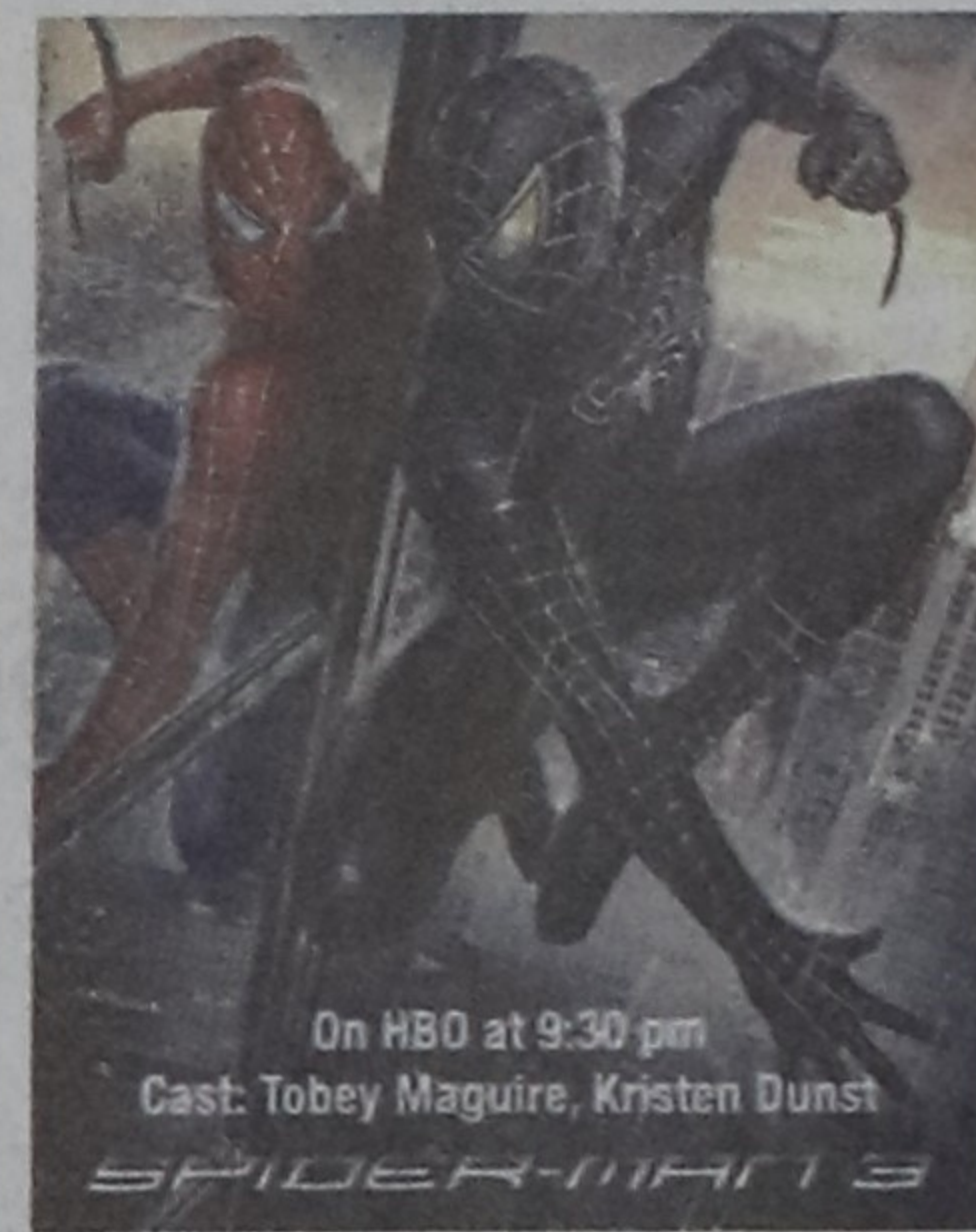
On HBO at 9:30 pm Cast: Tobey Maguire, Kristen Dunst

09:00 BBC World News 09:30 Asia Business Report 09:45 Asia Today (r) 10:00 BBC World News 10:30 World Business Report 11:00 BBC World News 11:30 World Business Report 12:00 BBC World News 12:30 World Business Report 12:45 Sport Today 01:00 BBC World News 01:30 World Business Report 01:45 Sport Today 02:00 BBC World News 02:30 HARDtalk (r) 03:00 BBC World News 04:00 BBC World News 04:30 World Business Report 04:45 Sport Today 05:00 World News Today 06:00 BBC World News 06:30 World Business Report 06:45 Sport Today 07:00 World News Today 08:00 BBC World News 08:30 HARDtalk (r) 09:00 BBC World News 09:30 Click (r) 10:00 World News Today 11:00 BBC World News 11:30 World Business Report 11:45 Sport Today