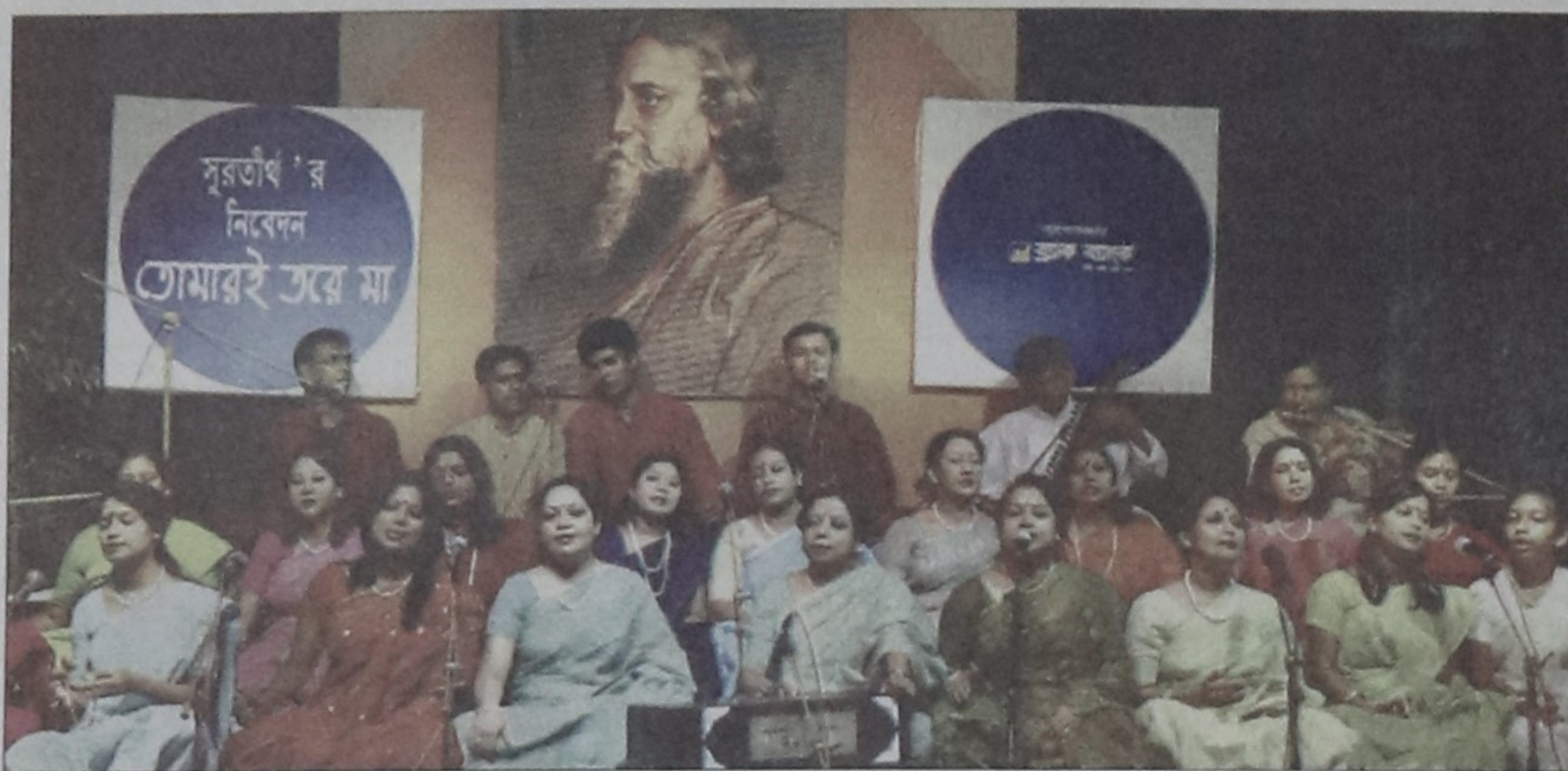
Surtirtha render Tagore's patriotic songs at the programme.