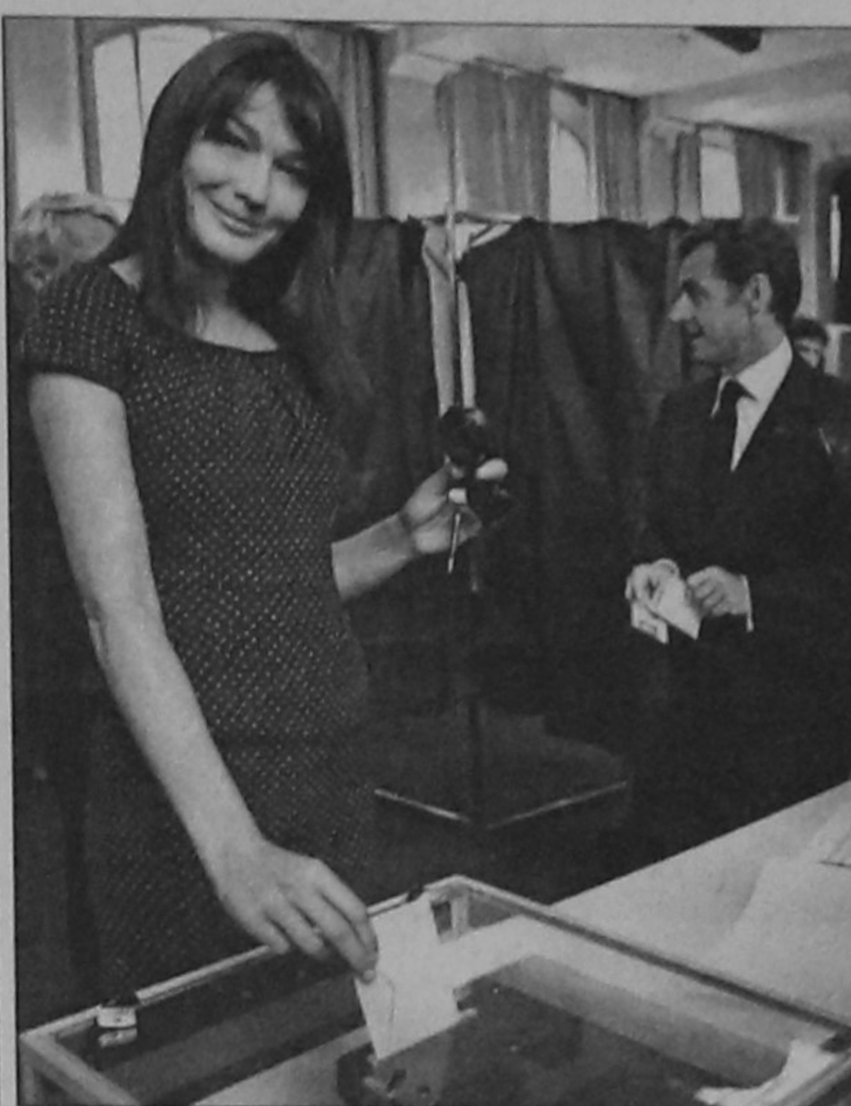
French President's wife Carla Bruni-Sarkozy casts her ballot for the European parliamentary election yesterday in Paris.

High unemployment across Europe has increased voter dissatisfaction with mainstream national parties, and scepticism over the EU's power to help spur economic recovery.