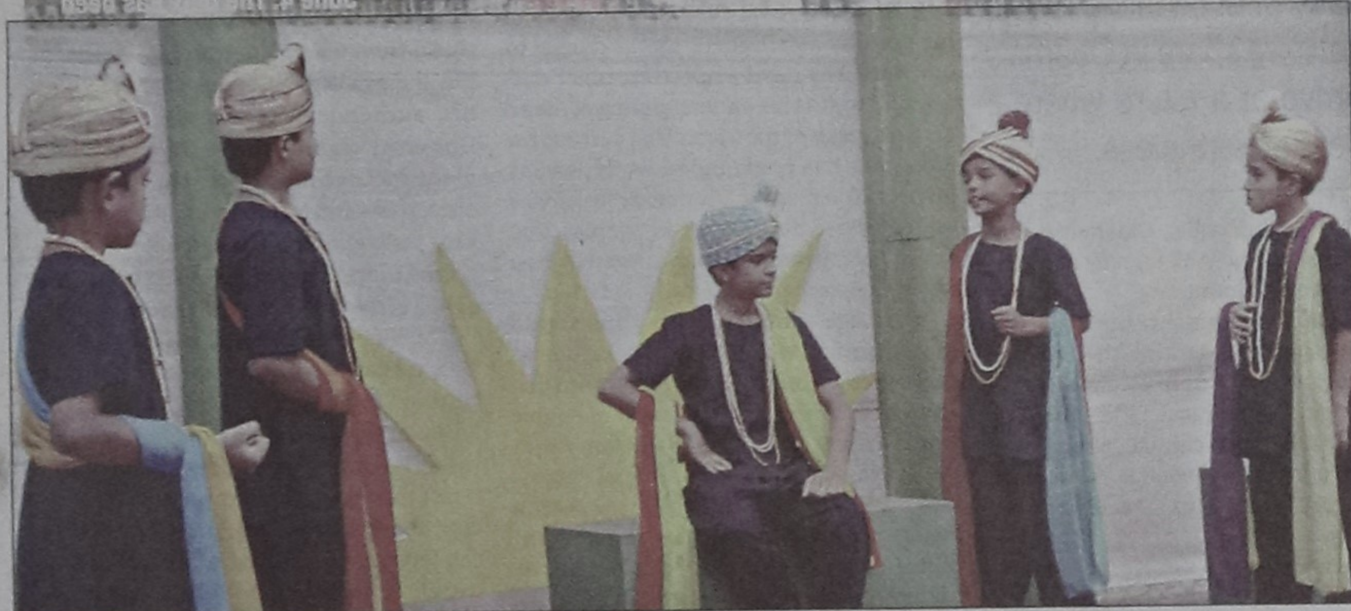
Child actors of Sonar Tori Cultural School stage the play "Gaan-er Pakhi."