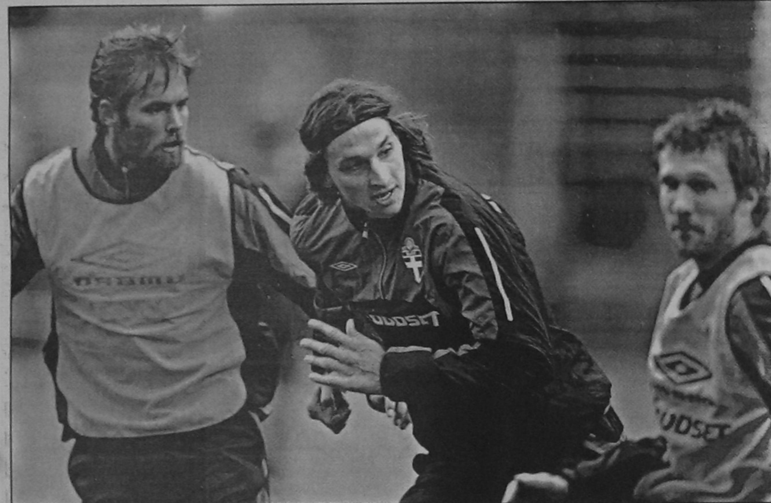
Swedish players Olof Mellberg (L) and Zlatan Ibrahimovic (C) train at the Rasunda Stadium in Stockholm on Thursday.

"Turnover is going up, trading profit is going up but they are still making a loss," he