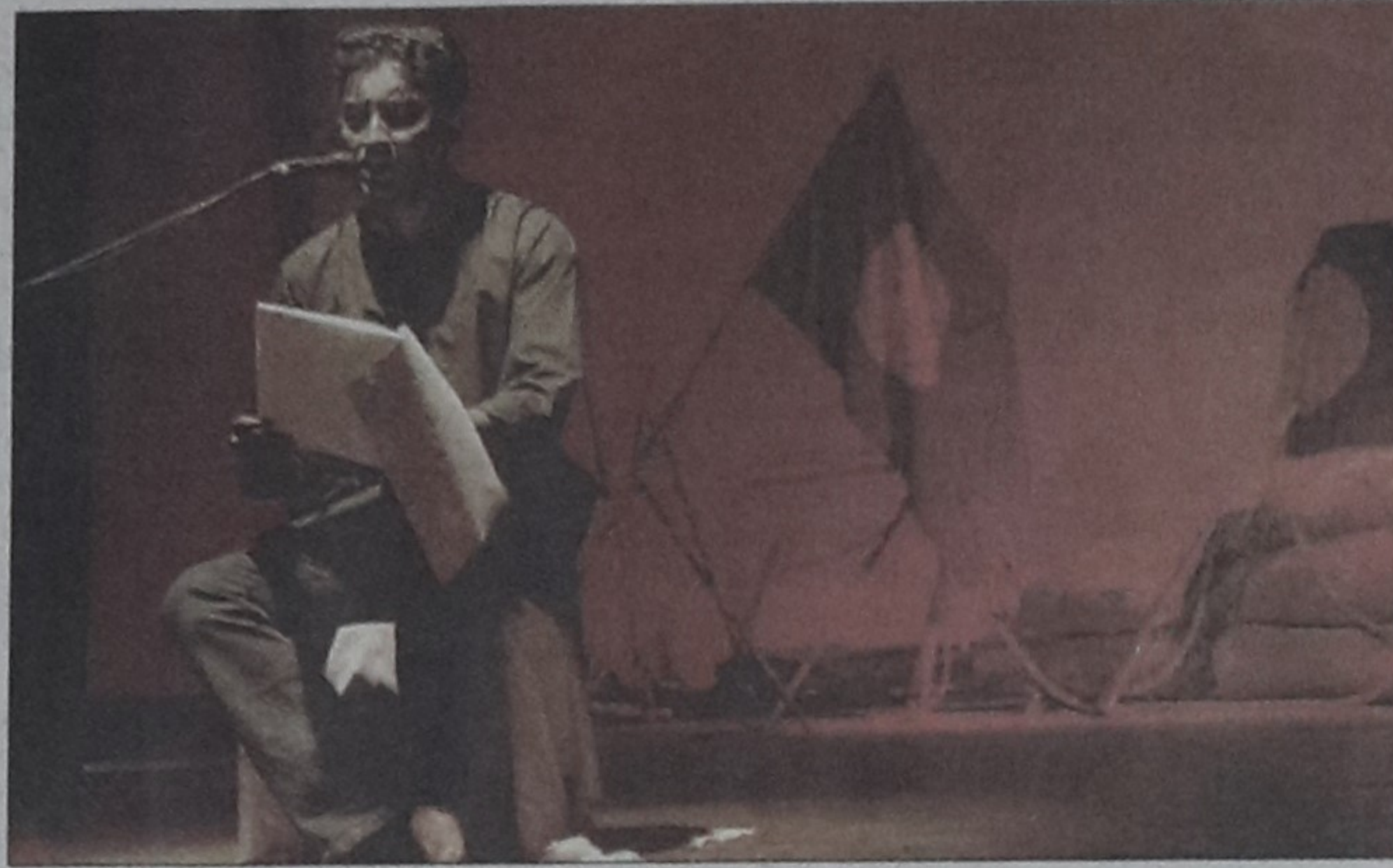
An Udichi member recites a letter from "Ekatturer Chithi" at the programme.