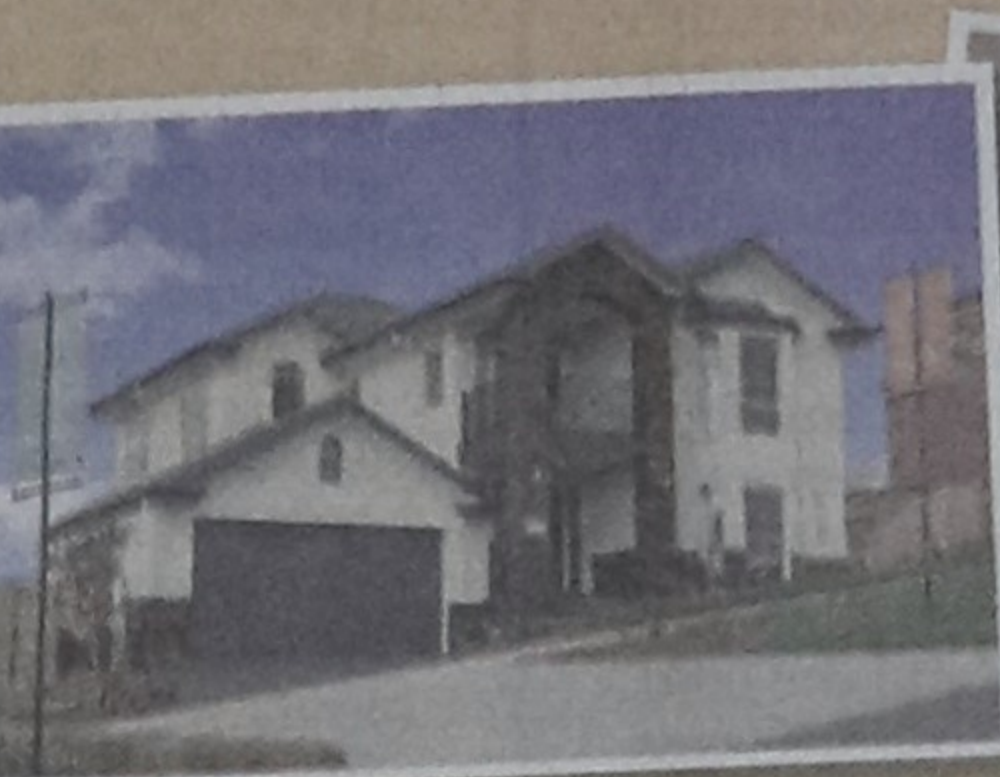
Architecturally designed homes