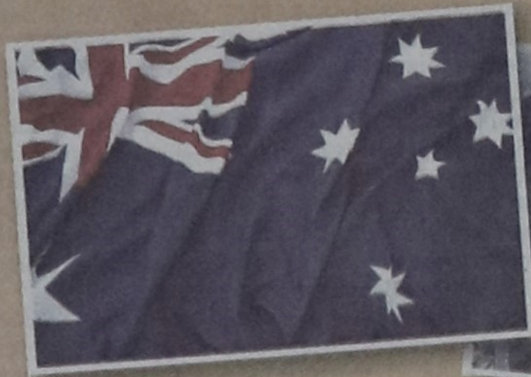
Migrate to Australia