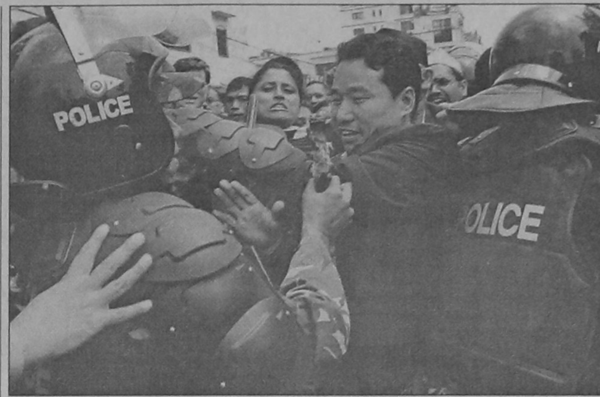
Unified Communist Party of Nepal (Maoist) lawmakers tussle with police during a protest in front of the government administrative building in Singha Durbar in Kathmandu yesterday. The Maoists were demonstrating against the Indian government over the alleged encroachment of Nepal's territory by Indian security forces in southwest Nepal.

He also expressed fears that the displaced may fall a prey to the propaganda of the extremists if not rehabilitated soon.