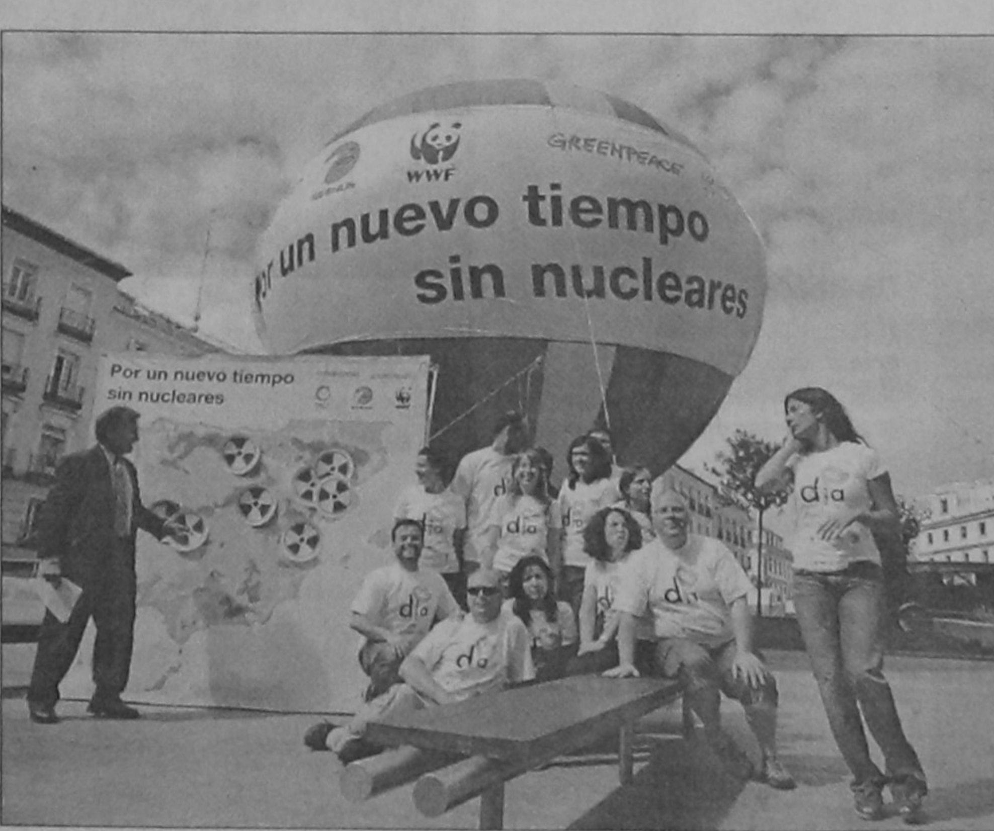
Greenpeace activists pose next to a balloon demanding a future without nuclear power on World Environment Day yesterday in the centre of Madrid. World Environment Day was established by the UN General Assembly in 1972 to mark the opening of the Stockholm Conference on the Human Environment.