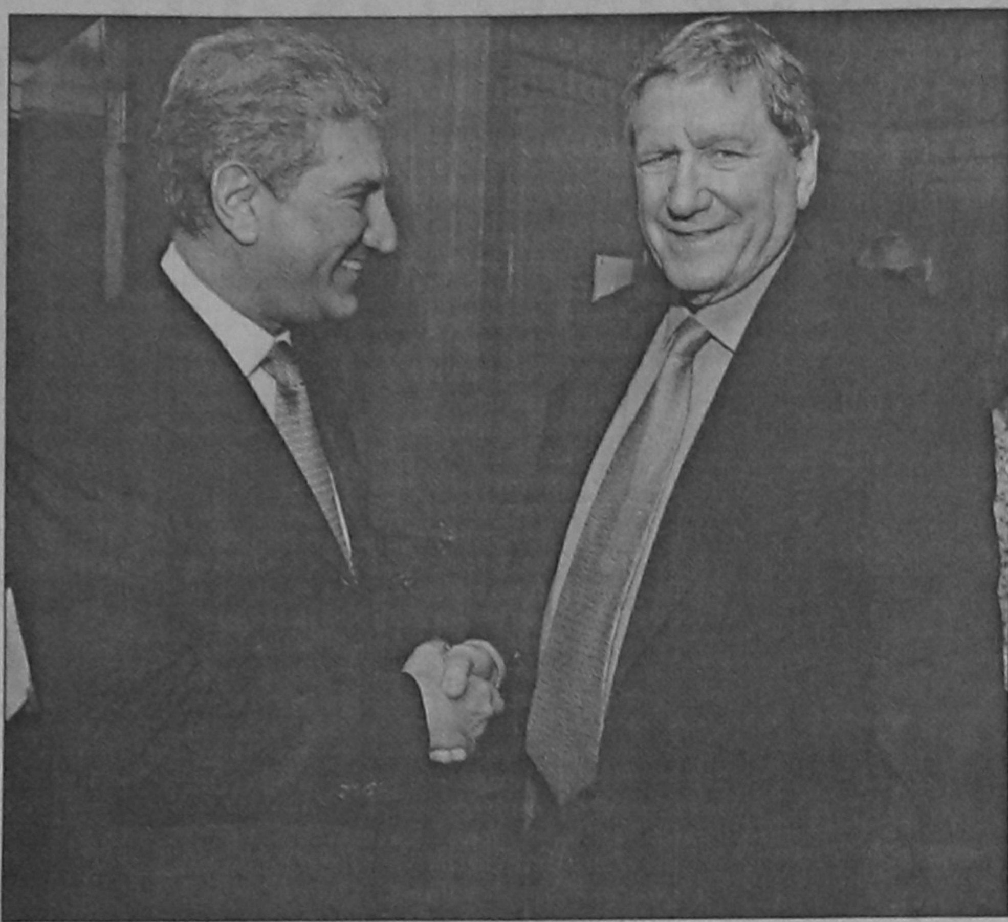
US Envoy for Afghanistan and Pakistan Richard Holbrooke (R) is welcomed by Pakistani Foreign Minister Shah Mehmood Qureshi upon arrival for a meeting in Islamabad yesterday.