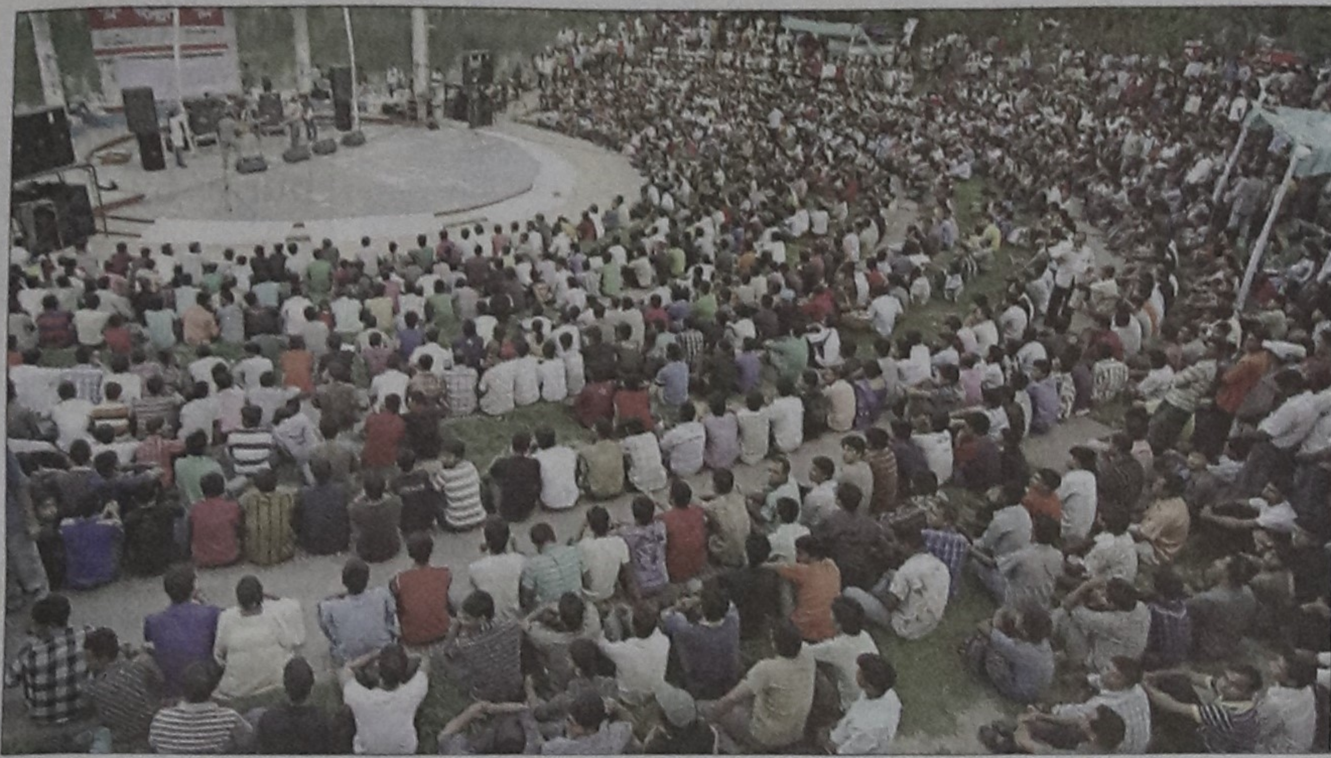
Eminent citizens, celebrities and people from all walks of life at Rabindra Sarobar at Dhanmondi in the city yesterday pledge to change themselves to bring about a positive change in the society as part of the 'Bodle Jao, Bodle Dao' (Change yourself, change others) campaign of the daily Prothom Alo.