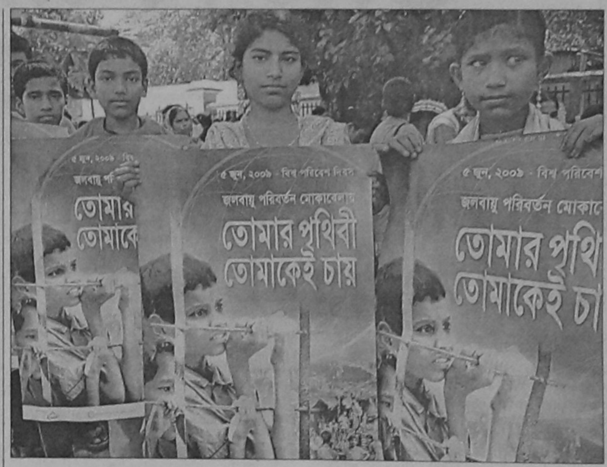
Coalition for the Urban Poor takes out a procession marking the World Environment Day from Shahbagh in the city yesterday.