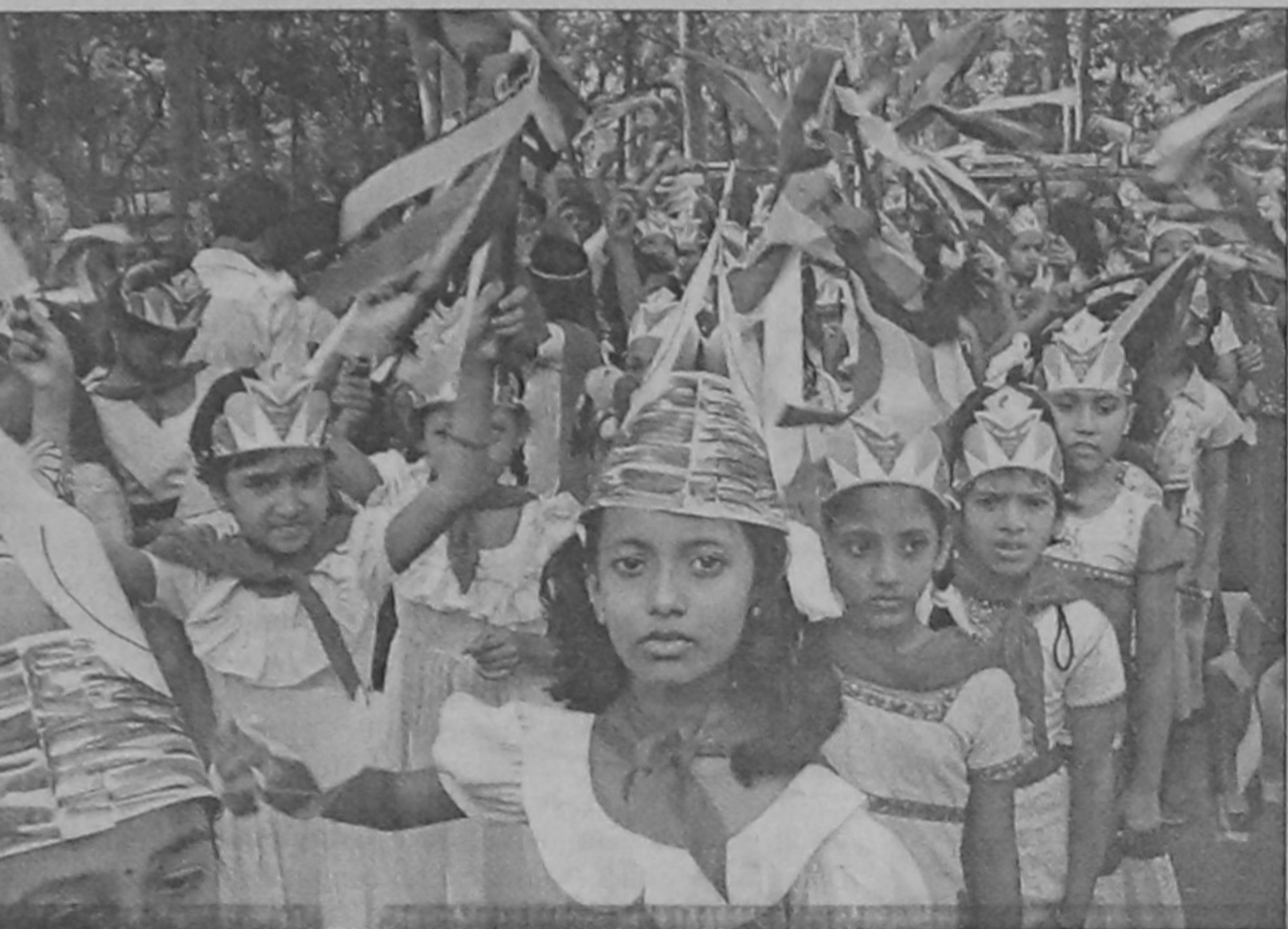
Dhaka city unit of Khelaghar takes out a procession from Bangladesh Shishu Academy in the city on the occasion of its council yesterday.

A private organisation arranged a cleaning programme on Kuakata beach to observe the day.