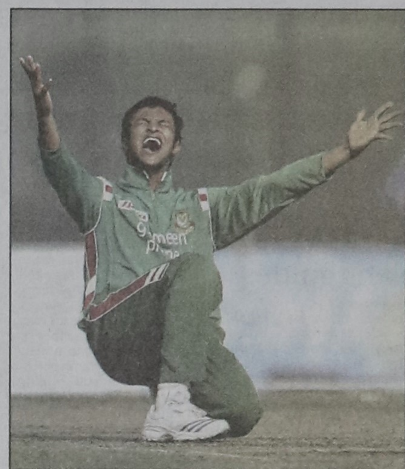
SHAKIB AL HASAN