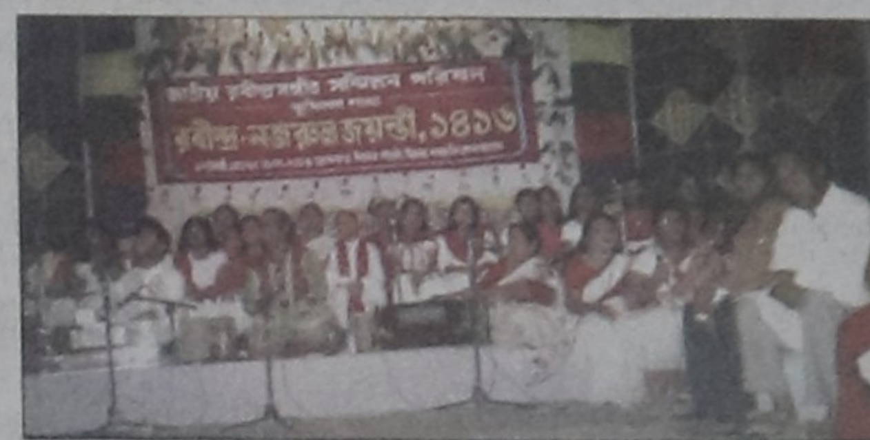
Artists perform at the programme.