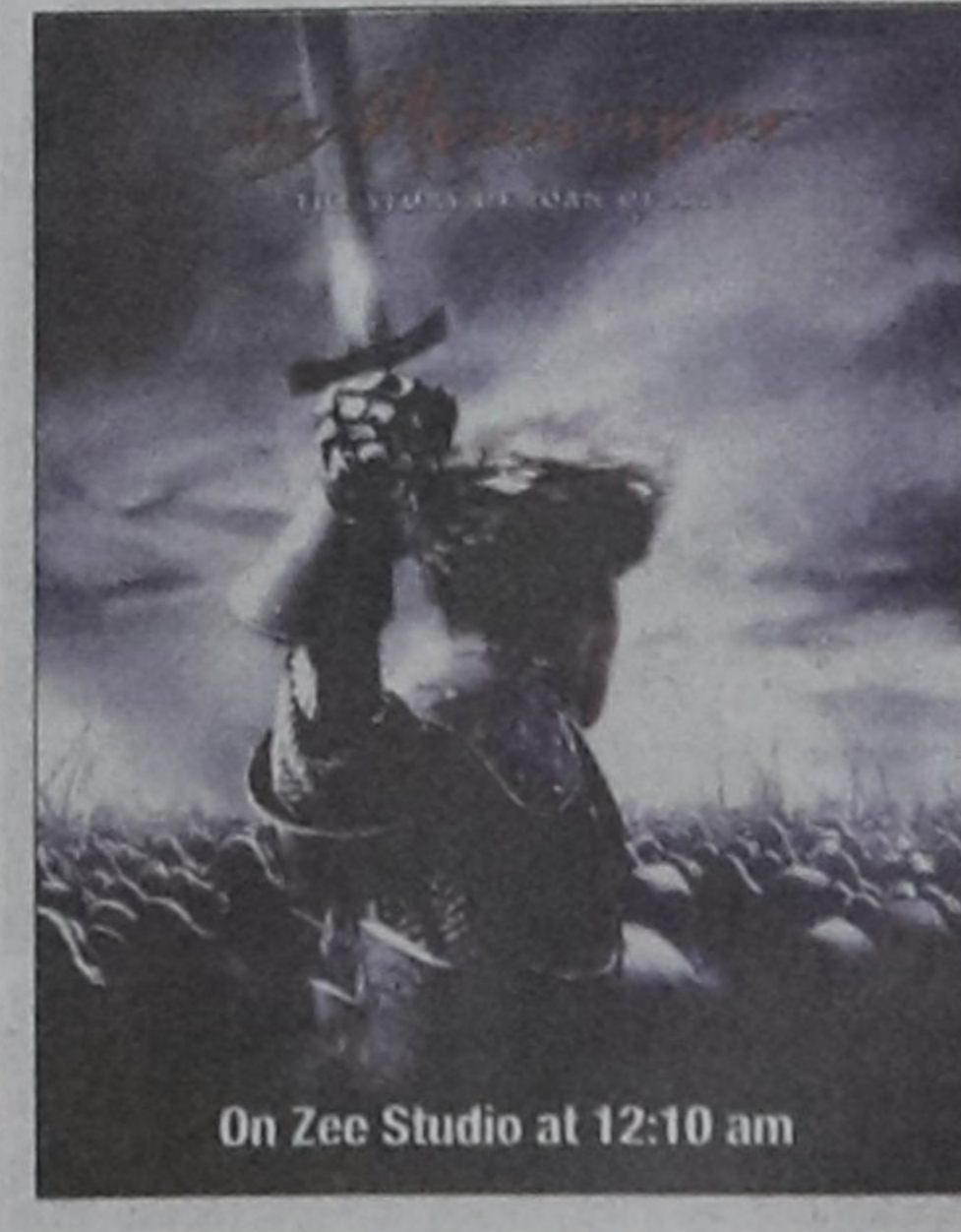
On Zee Studio at 12:10 am

05:35 Chetonaey Islam 06:45 Selected Programme 08:15 Drama Serial: House Full 09:00 Musical Programme 09:45 Drama Serial: Guide 11:35 Talk Show ETV 08:30 Ekusher Shokaal 09:55 Ekusher Business 02:30 Drama Serial: Eshkool 04:02 Drama Serial: Hitlu 06:00 Citycell Din-er Sheshey 06:20 Reporters Eye 06:50 Point of Order 08:15 Drama Serial: Shomudro Jol 09:05 X Crime 09:45 Daily Soap: Gulshan Avenue 11:25 Jonotara Mukhomukhi DESH TV 12:15 Dur Paath 05:02 Cartoon 05:30 Baati Ghar 08:15 Drama Serial: No Question No Answer 09:00 Concert STAR MOVIES 09:50 The Lizzie McGuire Movie 11:45 Street Warrior 01:30 Big Boss, The 03:30 Species 05:30 Whisper 07:25 Robocop 3 09:30 Bride & Prejudice 07:15 Ed Tv 09:30 The Invasion 11:30 Mr. Deeds STAR WORLD 09:00 Friends 09:30 According To Jim 10:00 My Wife And Kids 10:30 Hope And Faith 11:00 Whose Line Is It Anyway? 11:30 Ghost Hunters 12:30 The Apprentice