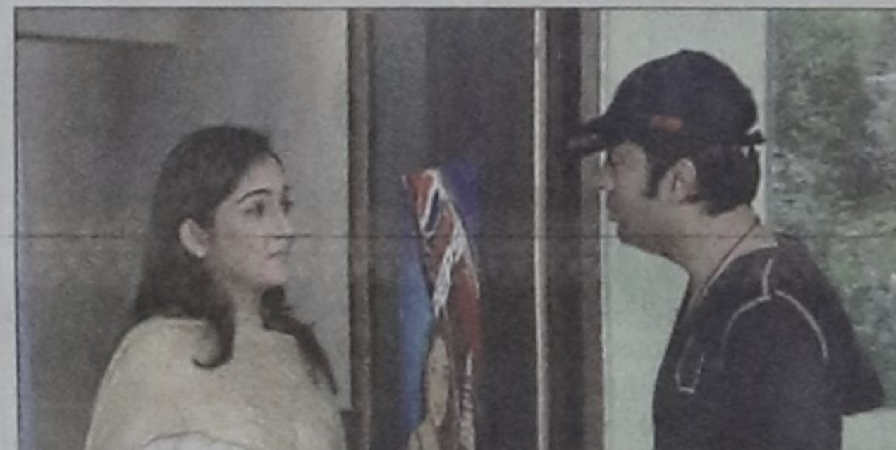
A scene from the serial.