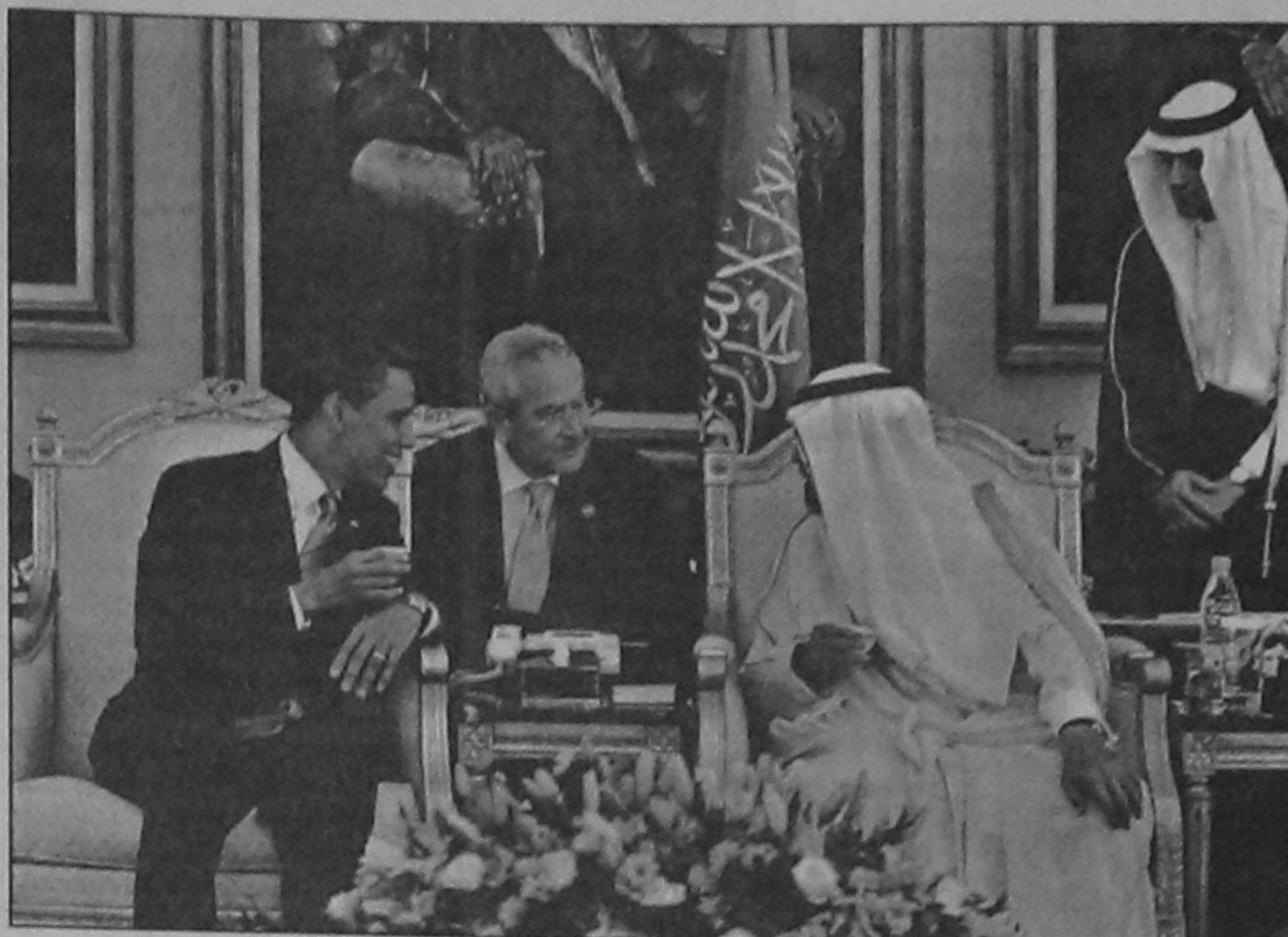
Saudi King Abdullah bin Abdul Aziz al-Saud (C-R) and US President Barack Obama (L) chat over coffee upon Obama's arrival at the King Khaled International Airport in Riyadh yesterday. Obama arrived in Saudi Arabia at the start of a mission to the Middle East where he will reach out to the world's Muslims and promote peace. Obama is due to hold talks with the king before heading to Egypt today to give a much-anticipated address to the Muslim world at Cairo University.

The situation is tense along the heavily fortified land border, where North and South Korean troops eye each other warily from either side of the demarcation line.