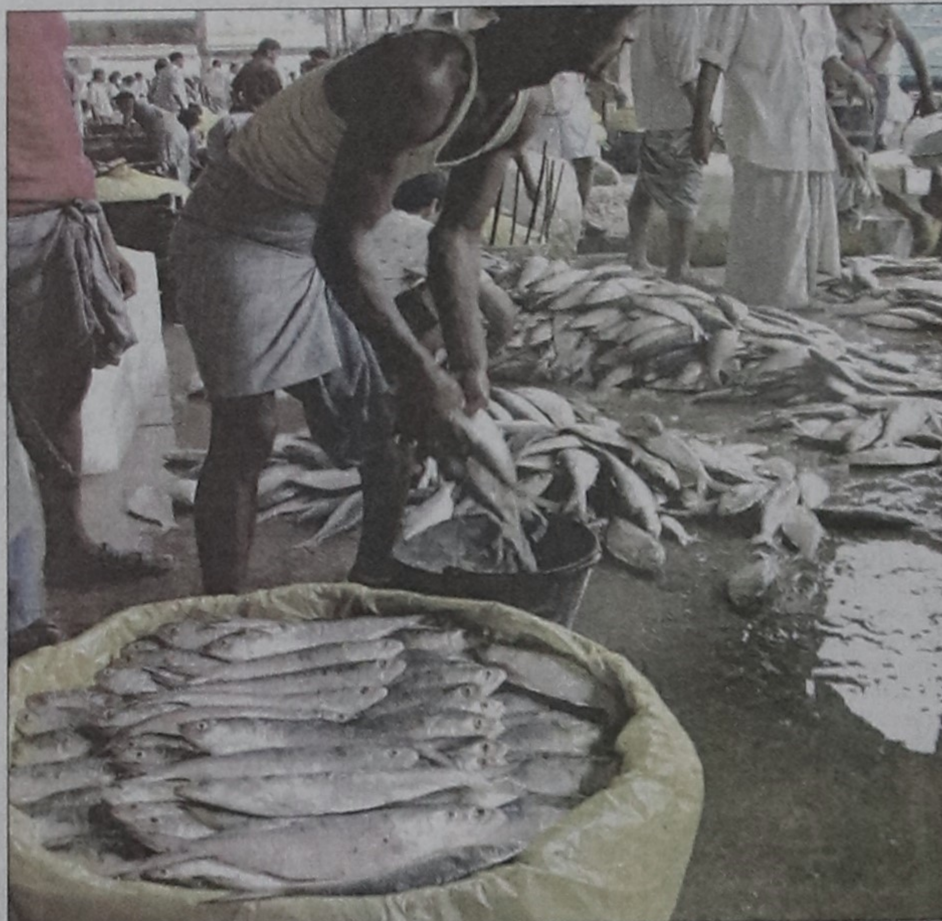
Hilsa captured near the St Martin's island yesterday are being packed at Teknaf in Cox's Bazar for shipment to Dhaka.