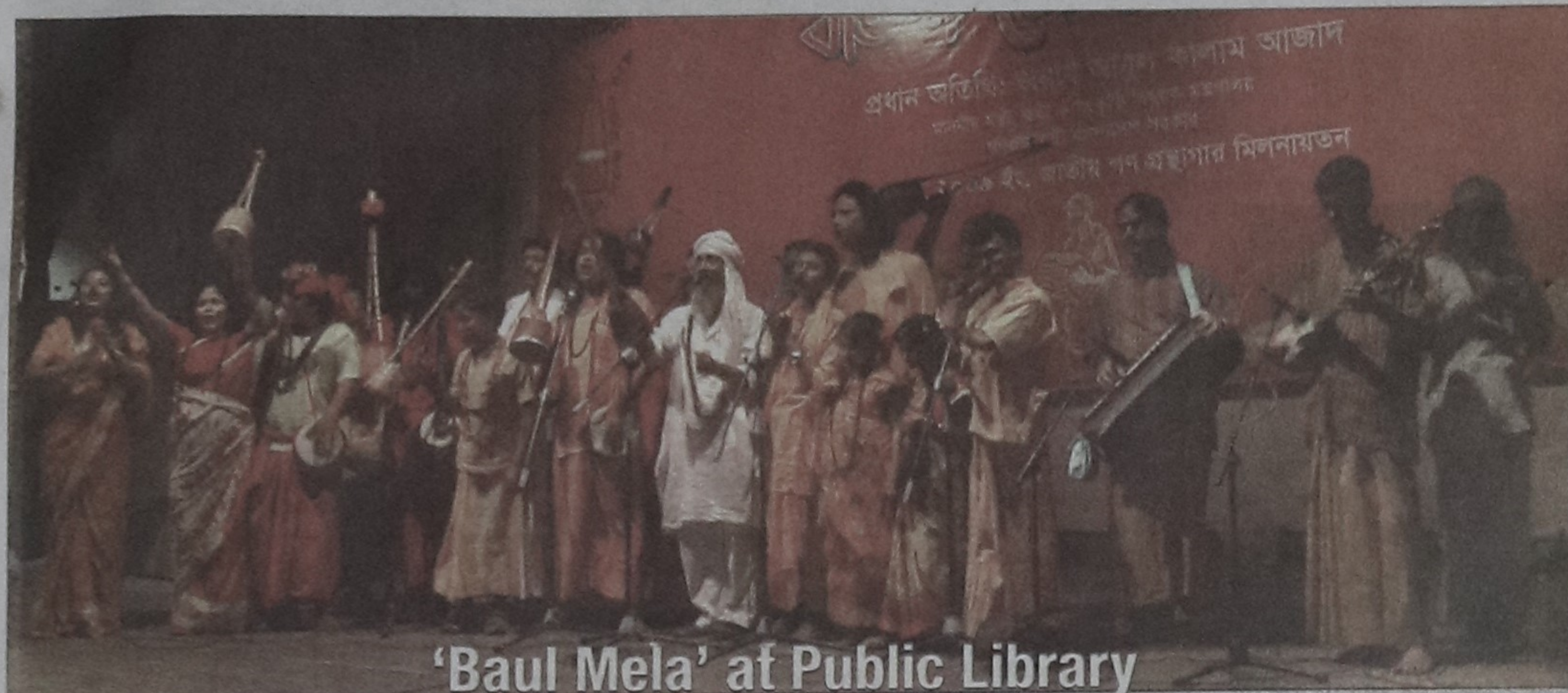
'Baul Mela' at Public Library