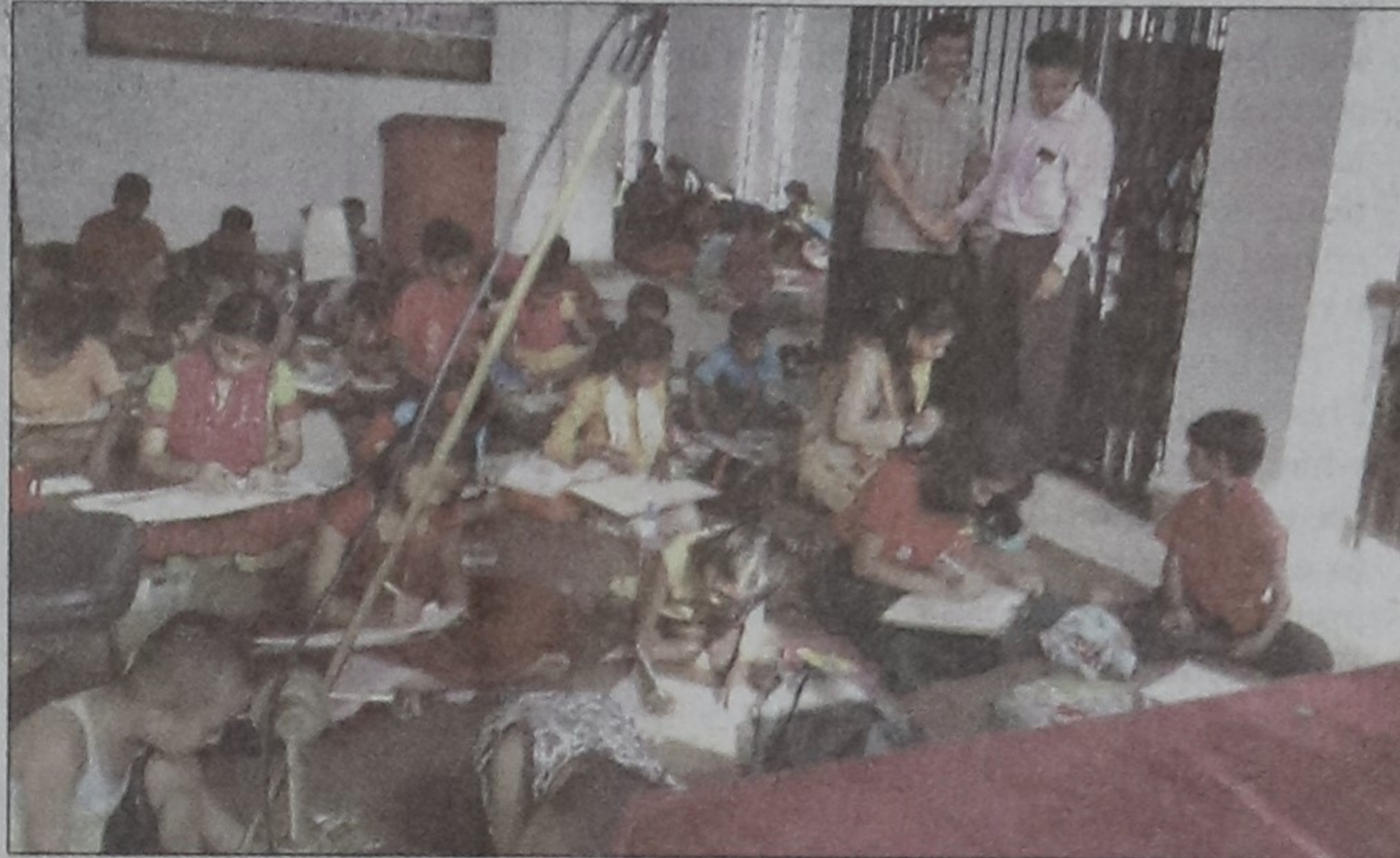
Young participants at the competition.

Sixty participants are to be selected as winners. The winners would get the privilege to visit an art exhibition on June 3 and the prize distribution is to be held on June 4.