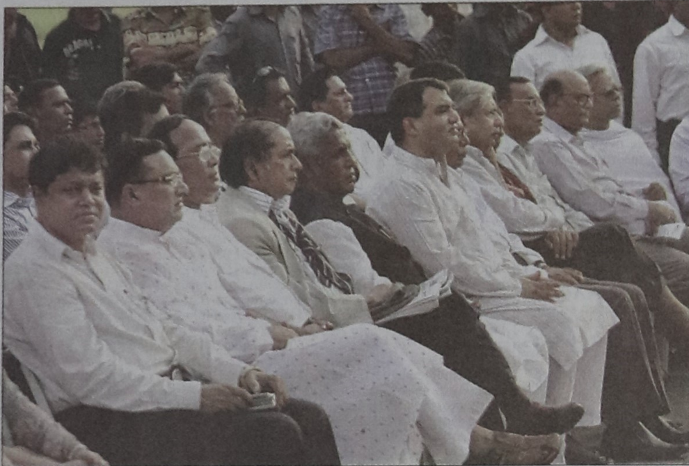
A section of the dignitaries who attended the "Save rivers, save Dhaka" programme, a Channel i and The Daily Star joint initiative, at the Jatiya Sangsad Bhaban complex yesterday. Speaker Abdul Hamid, right, speaks to the audience.

"We shall do everything we can to save the soil and rivers of the country,"