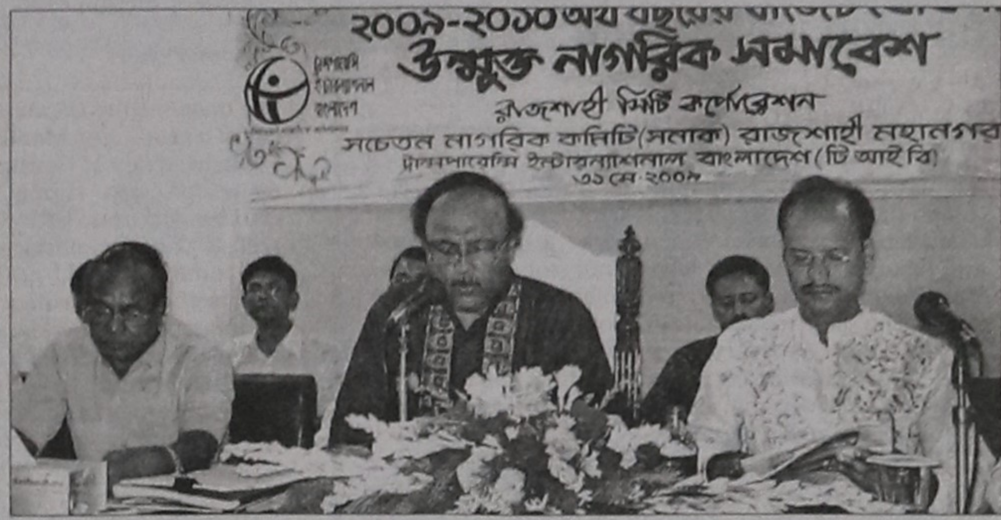
Rajshahi City Corporation Mayor AHM Khairuzzaman Liton announces budget for fiscal 2009-10 for the city corporation yesterday.