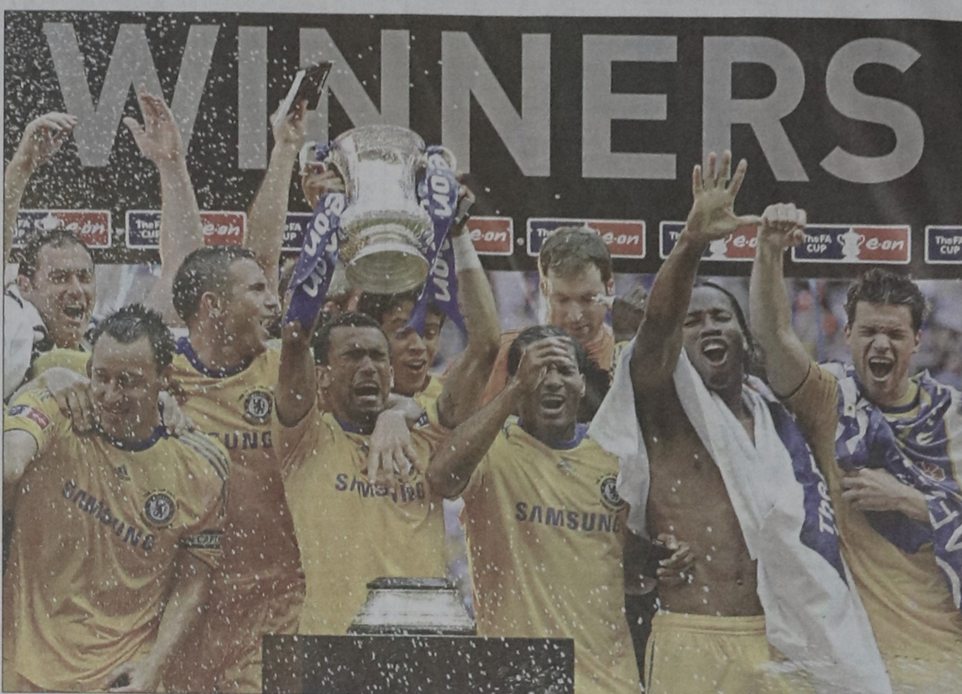
Chelsea players are jubilant after winning the FA Cup 2009 by beating Everton 2-1 in a come-from-behind performance at Wembley on Saturday. The win saw the Blues claim their first piece of silverware for the season and ensured that caretaker coach Guus Hiddink left on a high.

But Chelsea can never be counted out when Lampard is in the team. In the 72nd minute, the England midfielder cut inside Phil Neville to work space for a swerving shot that Howard could only help into the net.