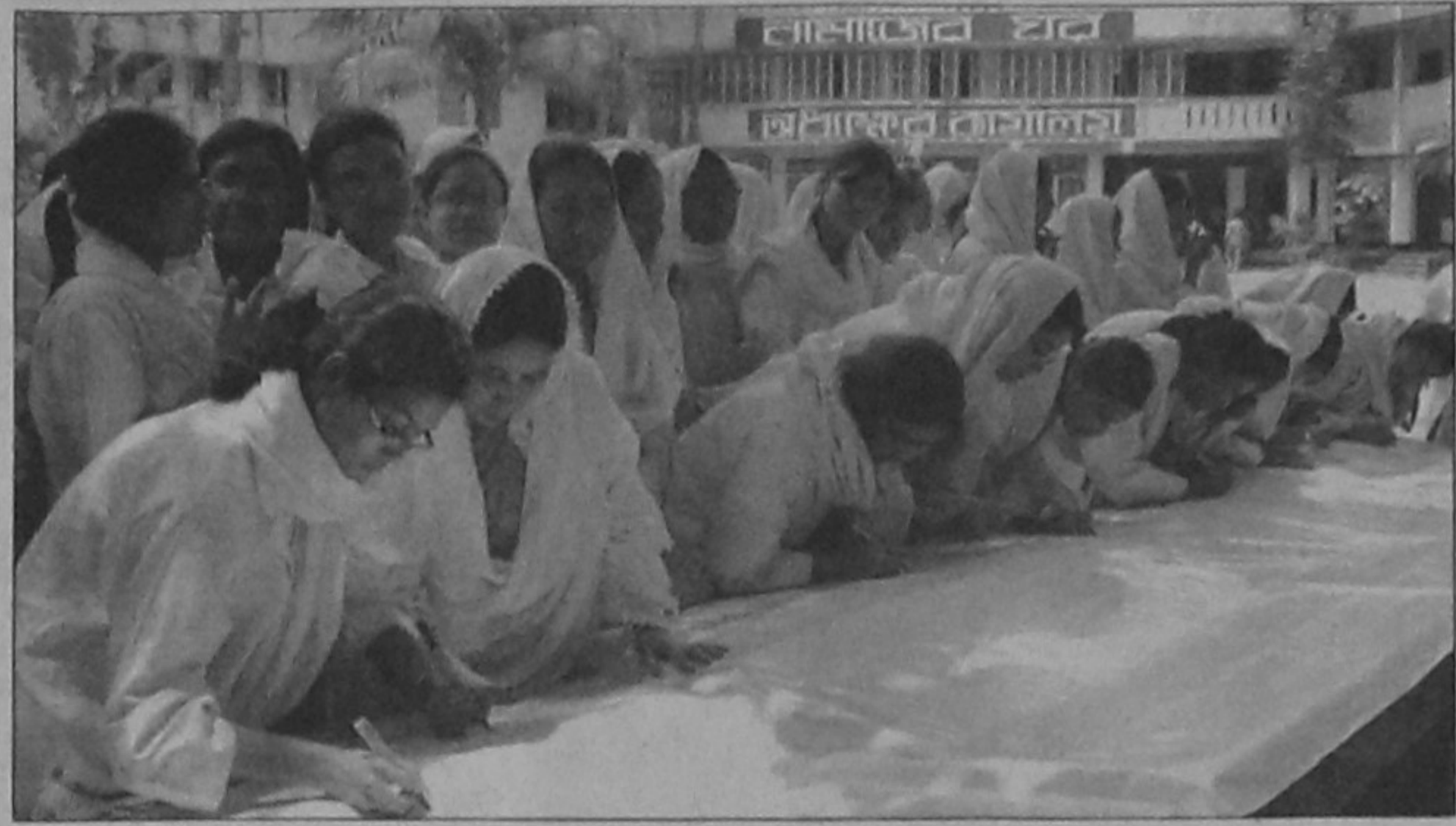
The students of Motijheel Ideal School and College write their pledges on a banner on the institution premises in the city yesterday as part of the 'Bodlie Jao, Bodlie Dao' (Change yourself, change others) campaign of the daily Prothom Alo.

The Westin is also hosting 'Modern Australian Food Promotion'. The event, which began yesterday and will continue till June 12 at its Taste restaurant, is featuring Sydney Rock Oysters, Moreton Bay Bugs, Tasmanian Oak Smoked Salmon and much more, including delicious desserts.