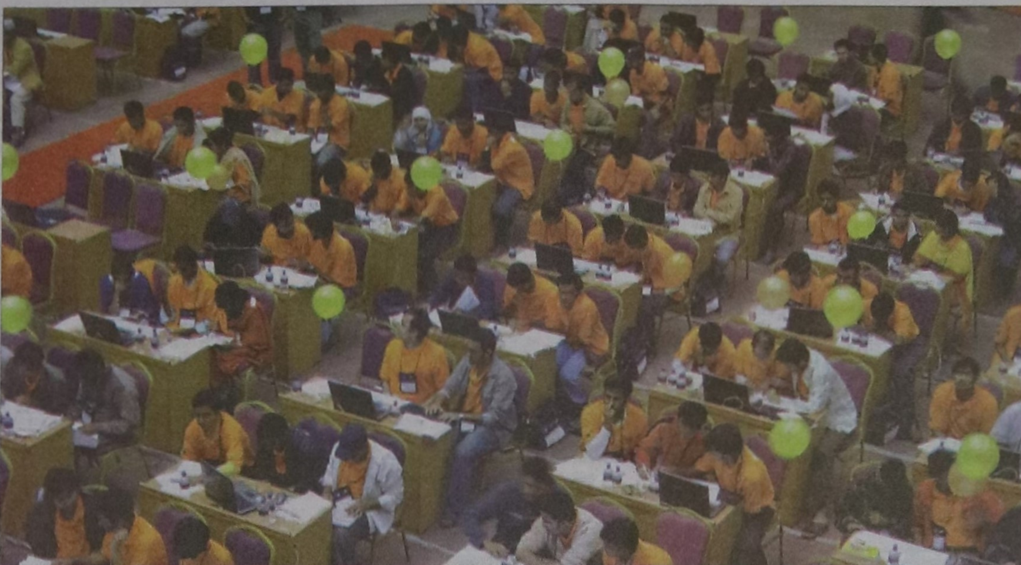
The picture shows participants in a programming competition in Dhaka. ICT stakeholders demand a larger share in the upcoming 2009-10 budget.

In Bangladesh, yearly turnover of the local ICT market is around Tk 500 crore but local ICT service makers are yet to gain the confidence of both private and public institutions. It means foreign IT firms are bagging a majority of the large-scale projects in the country.