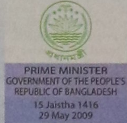
PRIME MINISTER GOVERNMENT OF THE PEOPLE'S REPUBLIC OF BANGLADESH 15 Jaishtha 1416 29 May 2009

On behalf of the Government and the people of Bangladesh, I pledge our continued support to the United Nations for promotion and protection of world peace.