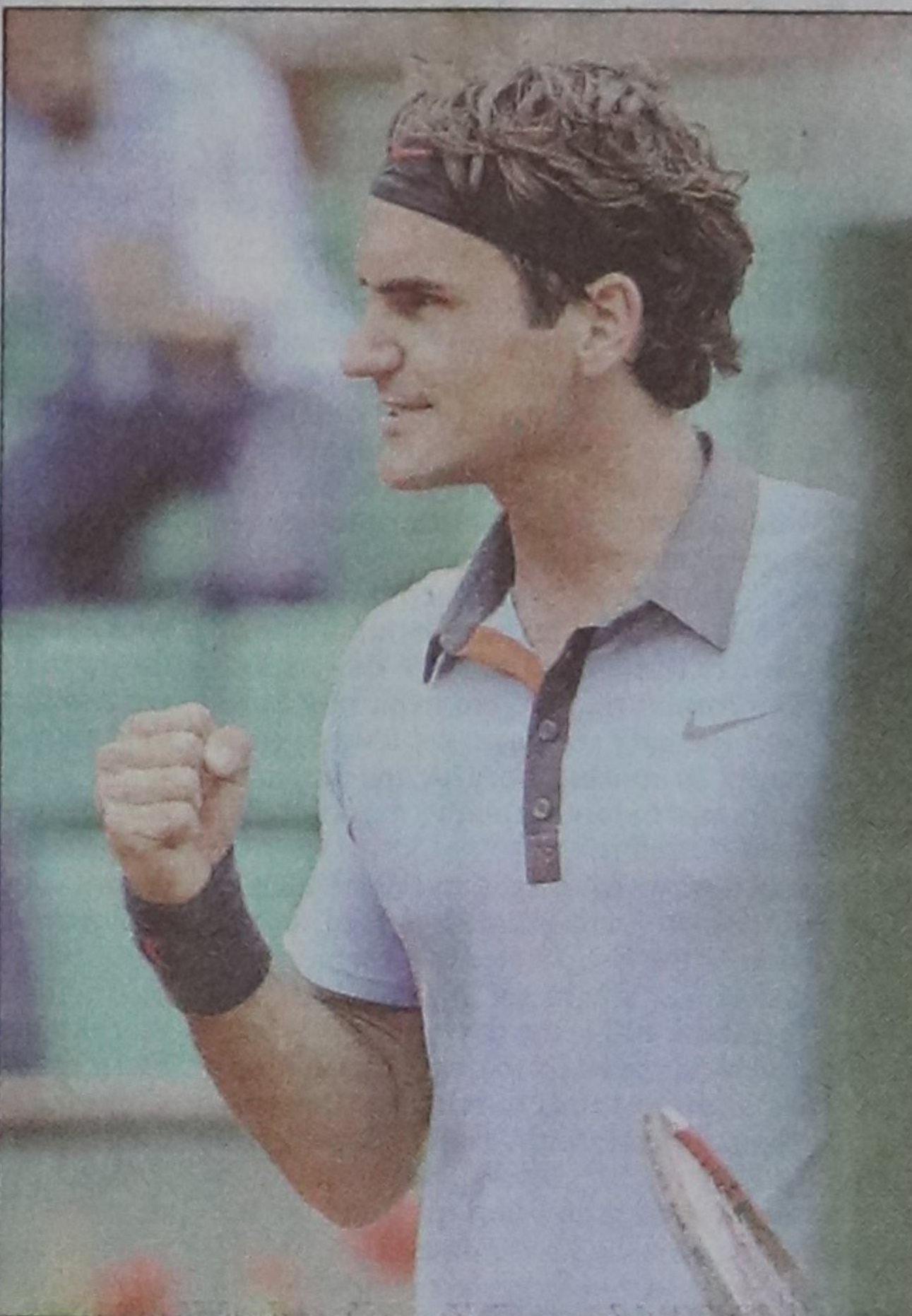
Second-seeded Swiss Roger Federer pumps his fist after his hard-fought win against Jose Acasuso of Argentina in their French Open second round encounter at Roland Garros in Paris yesterday.