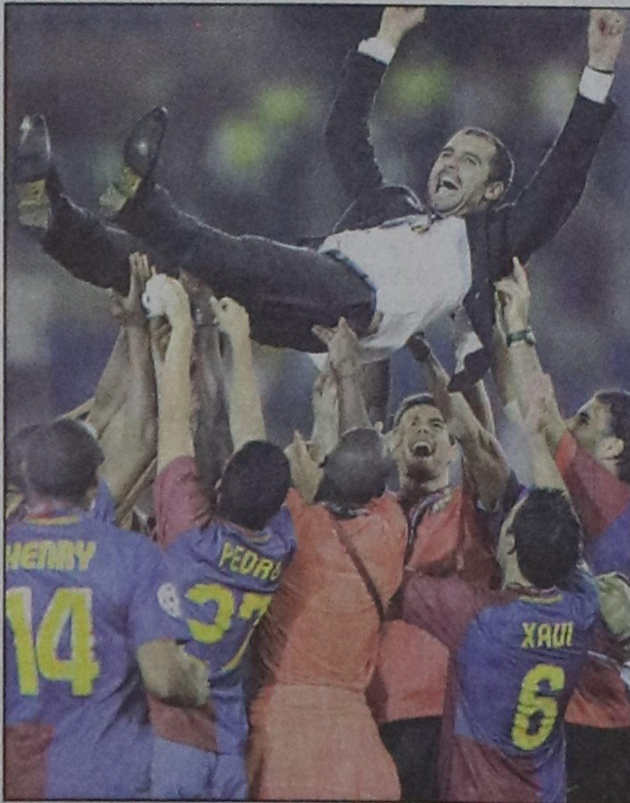
Barcelona players lift their coach Josep Guardiola (top) up after winning the Champions League final against Manchester United at the Olympic Stadium in Rome on Wednesday.