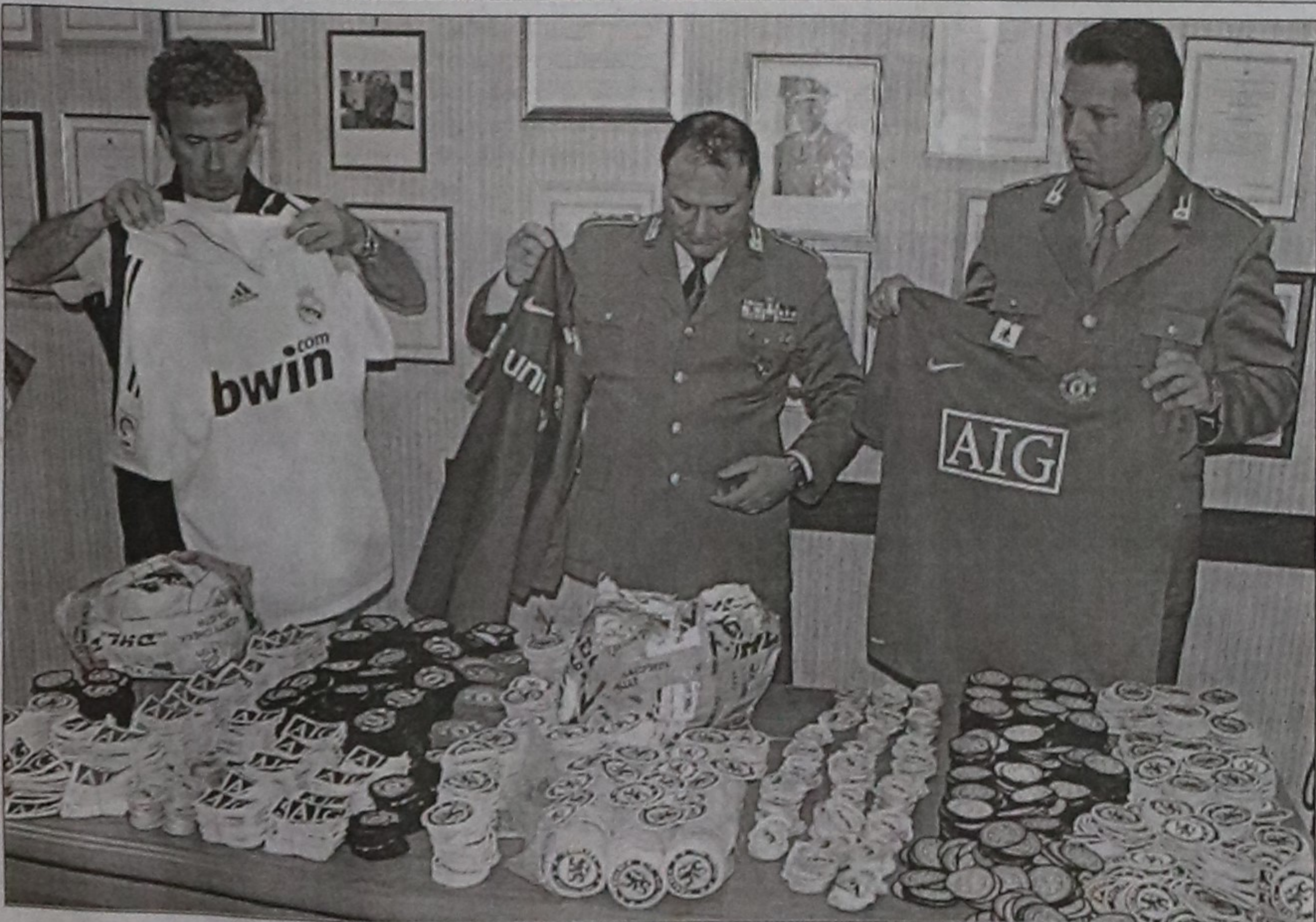
Policemen hold jerseys of Barcelona (C) and Manchester United (R) with counterfeit logos (on table) seized at Rome's Ciampino Airport on Tuesday.

The spokesman confirmed that two English fans had also been arrested at known trouble-spot Campo de Fiori for being drunk and bothering passers-by.