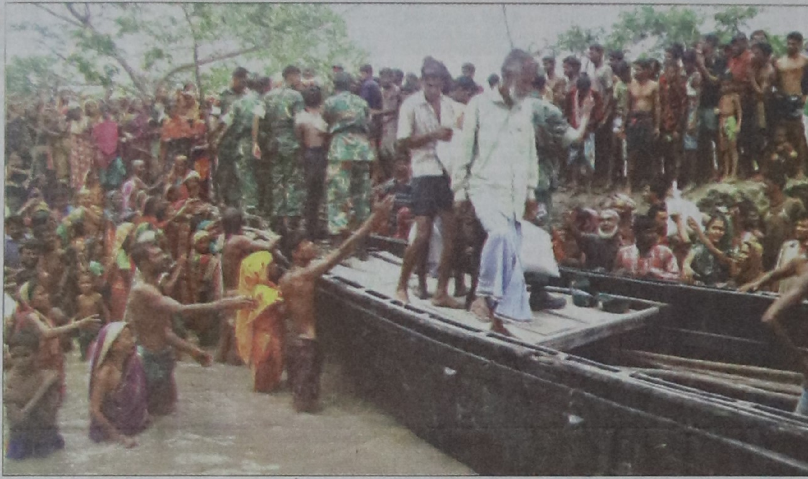
Hungry and homeless people throng a boat carrying the army bringing relief materials to Khelpetua village under Gabura Union in Khulna district yesterday, two days after Cyclone Aila hit the coastal areas.