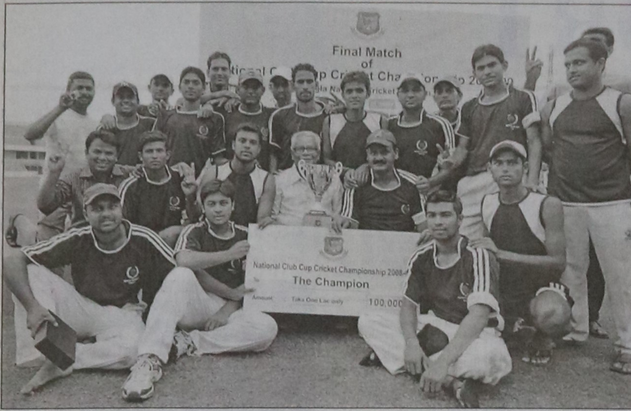
Players and officials of National Cricket Club of Nilphamari pose with the National Club Cup trophy at the Sher-e-Bangla National Stadium in Mirpur yesterday.