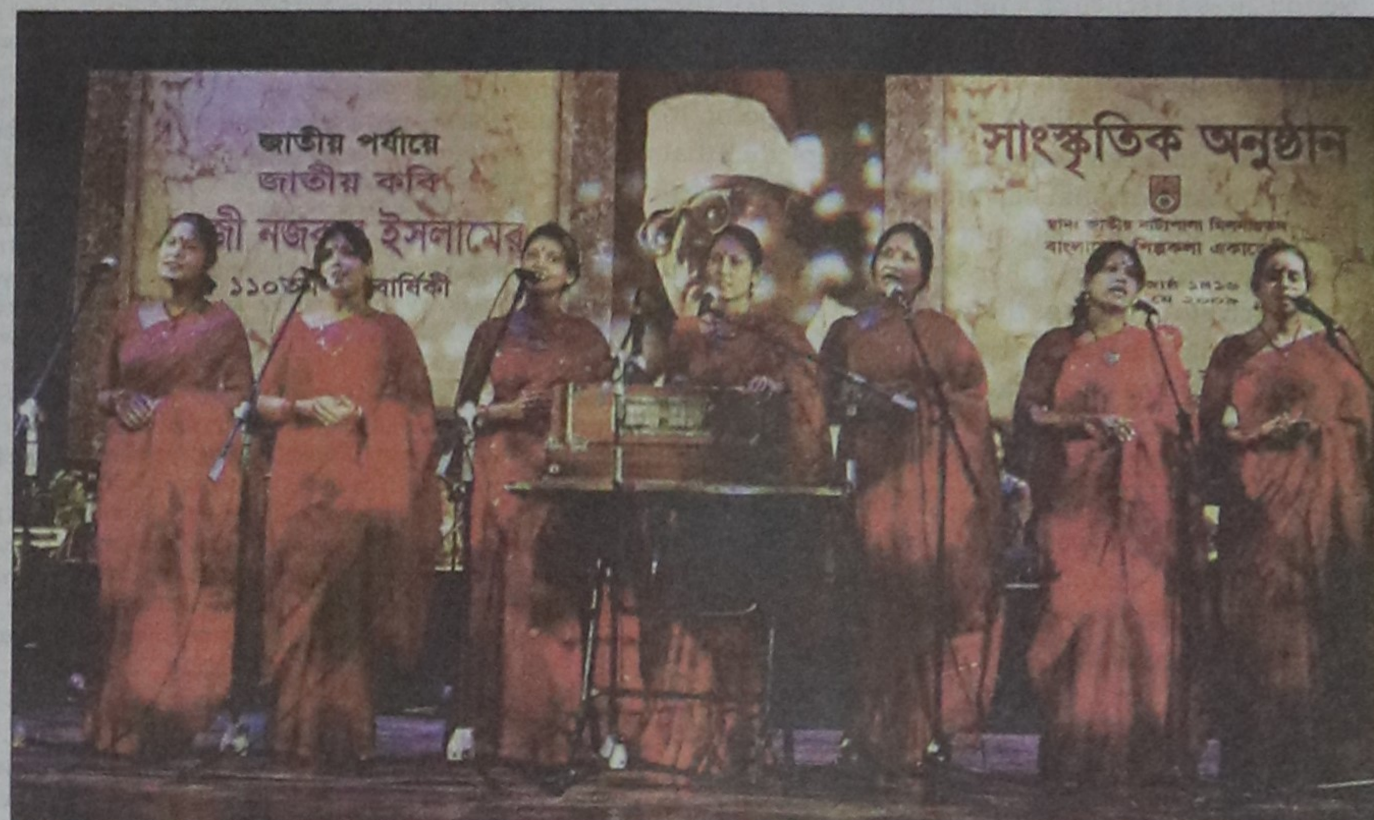
The Bard remembered: Artistes celebrate Nazrul's birth anniversary with festivity.