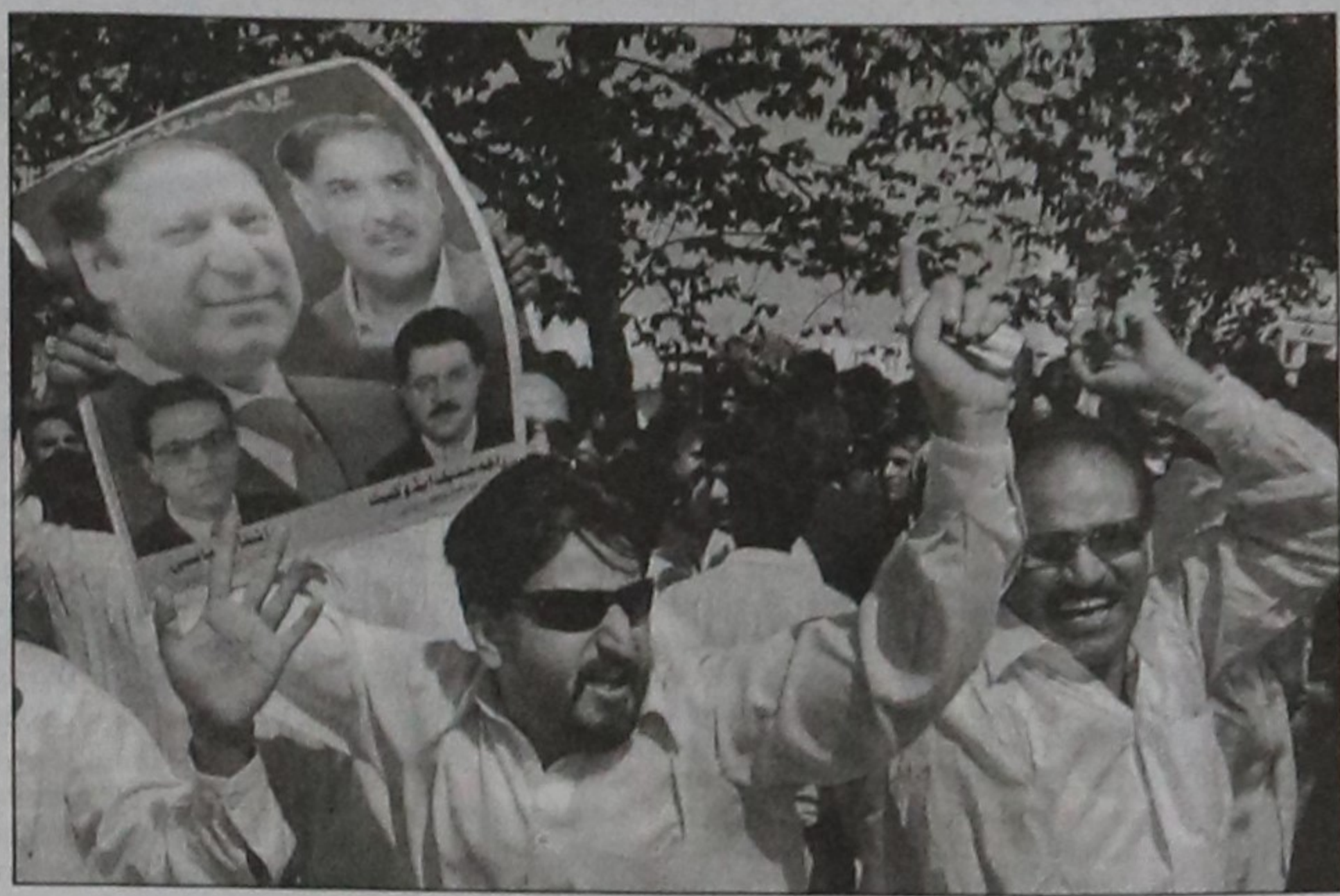
Supporters of former Pakistani premier Nawaz Sharif dance after a court verdict outside the Supreme Court building in Islamabad yesterday. Pakistan's Supreme Court suspended a ban on opposition leader and former prime minister Nawaz Sharif from holding office and contesting elections.

also evading repeated duty orders. Only 100 cops of the Elite Police Force (EPF) and four platoons, comprising around 136 individuals, of the Frontier Constabulary, are reporting for duty, sources added. It may be noted that the EPF had refused to be deployed in Swat to improve the law and order situation, saying they would prefer quitting their jobs rather than being posted in the 'death zone'. The inspector general of police (IGP) had directed the cops several times to report to their respective police stations, but all attempts have failed to sway the police officials. Once considered a plum posting, Swat is now being avoided by the cops. They are using all their contacts to pressurise higher police authorities for transferring them out of the hilly town.