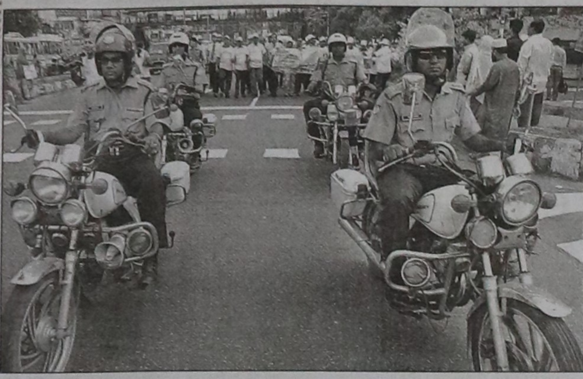
Staffs of Bangladesh Betar and traffic policemen bring out a motorcycle rally from Shahbagh Betar Transmission Centre in the city yesterday marking the 4th anniversary of FM 97.6 of the state-owned radio station's traffic transmission programme.

The radio will install the centres at Barisal, Khulna, Sylhet, Bogra, Mymensingh and Cox's Bazar.