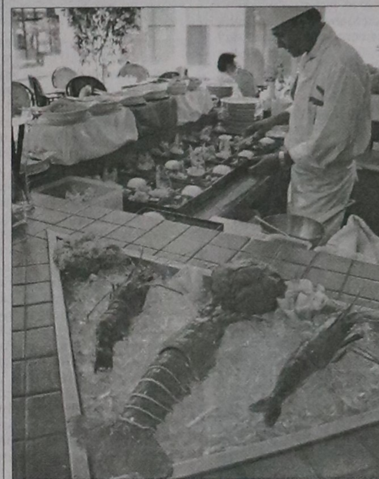
A chef prepares delicacies at Japanese Bento Box Menu that began on May 1 at Sonargaon Hotel in Dhaka. The festival will continue until June 30.