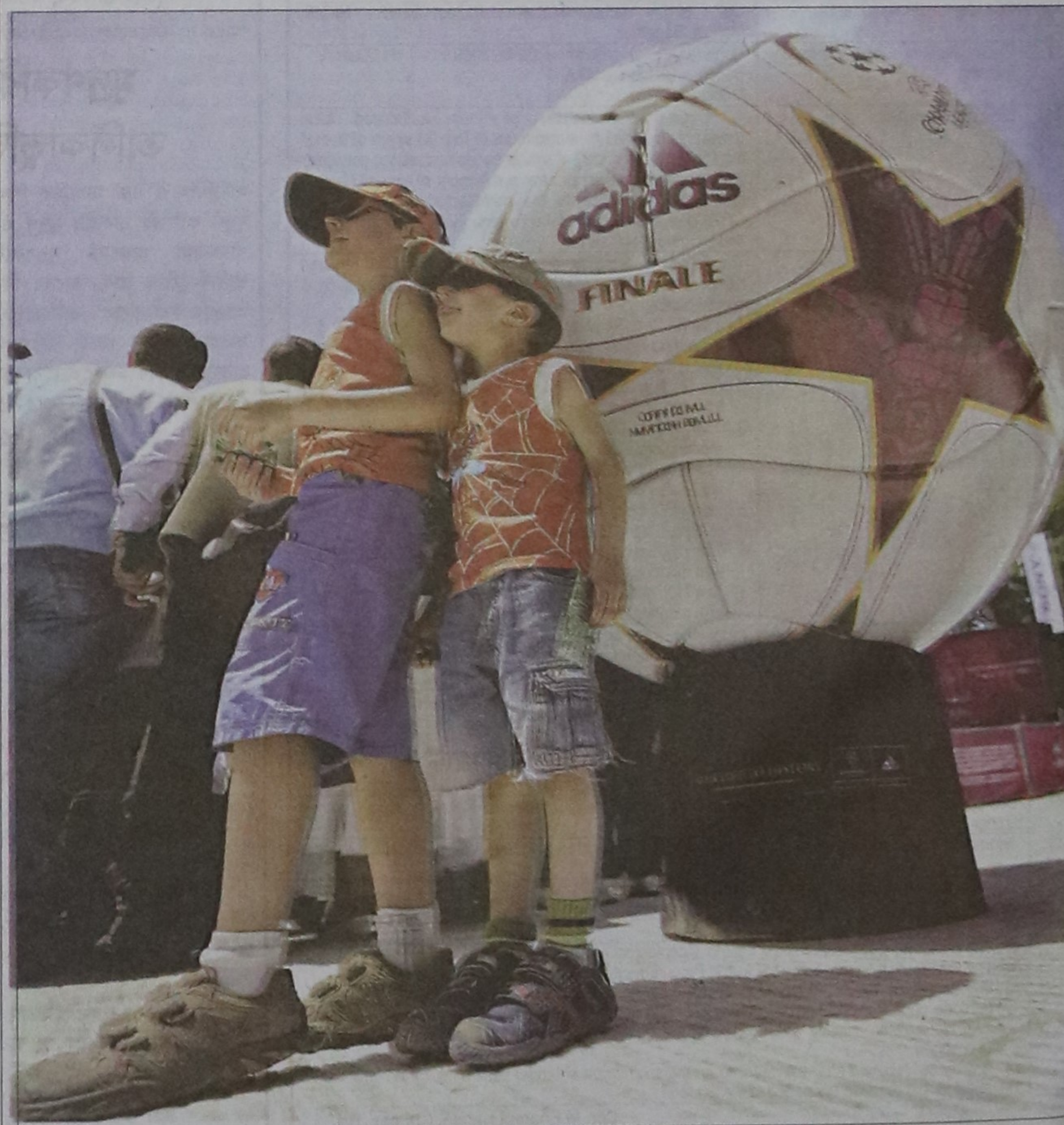
Children pose with a giant Champions League football at the Champions Village in Rome on Saturday.

Forwards: Lionel Messi (Barcelona), Carlos Tevez (Manchester United), Sergio Aguero (Atletico Madrid), Lisandro Lopez (Porto), Diego Milito (Genoa), Gonzalo Bergessio (San Lorenzo).