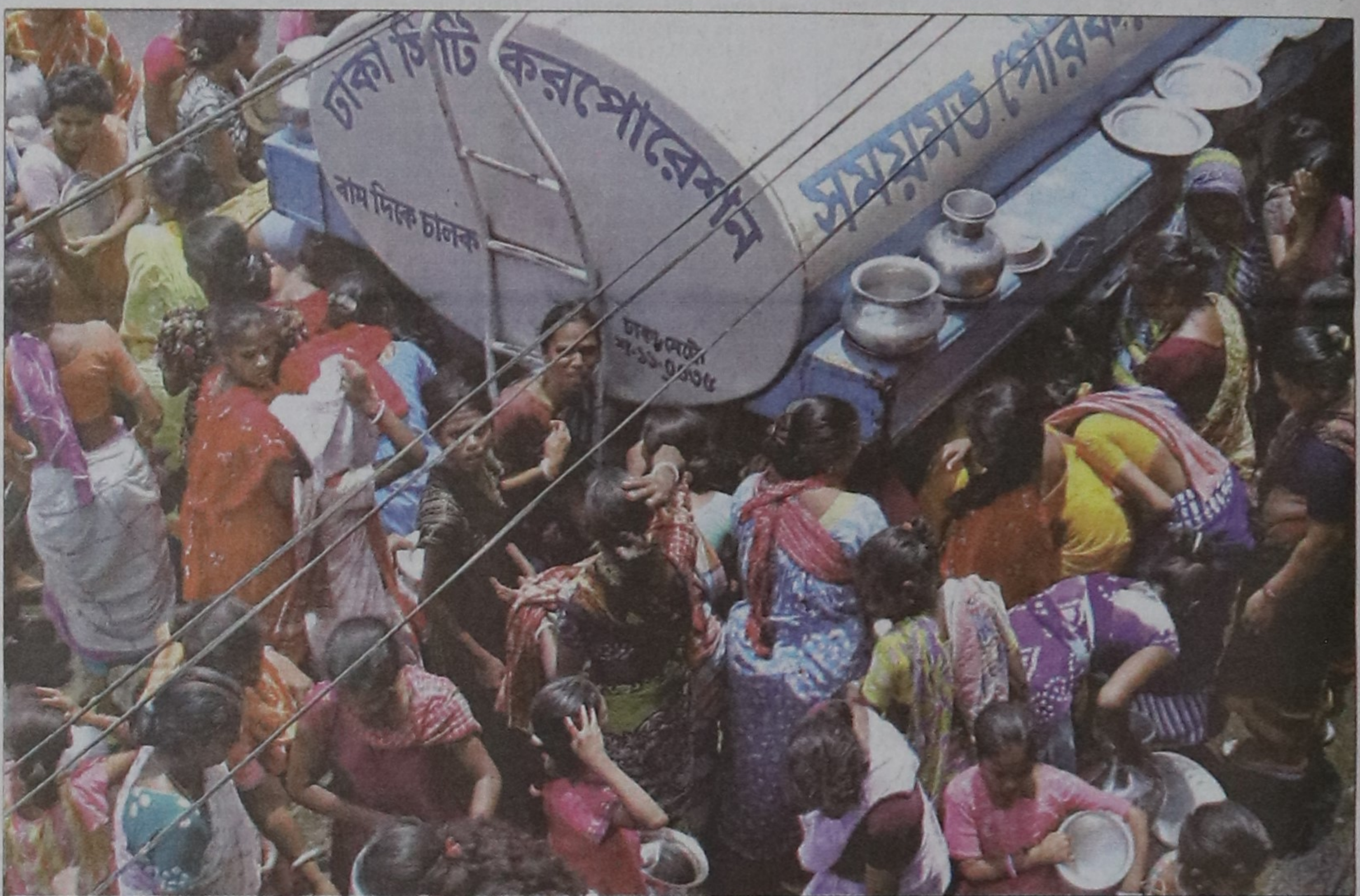
Residents of Tikatuli Sweeper Colony suffering from acute shortage of water desperately try to collect water from a lorry of Dhaka City Corporation on Tikatuli-Narinda Road in the capital yesterday.