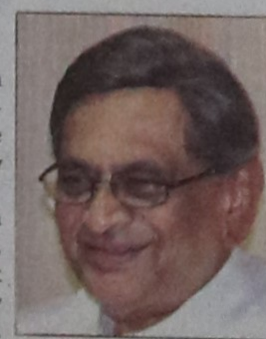
Somanahalli Mallaiah Krishna