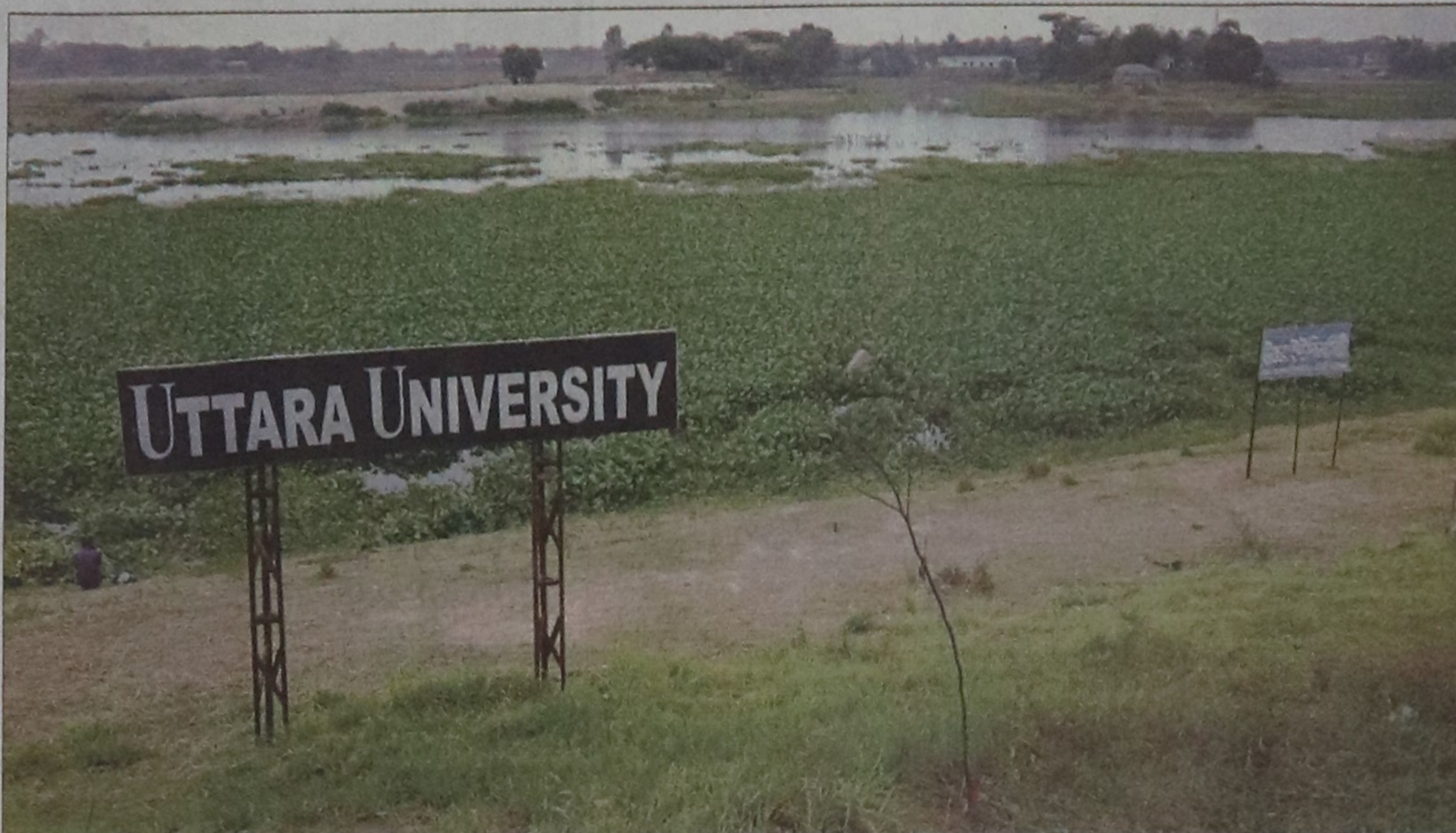
The authorities of Uttara University put up signboards on the floodplain of Turag river with a plan to set up their campus on the vast wetland.