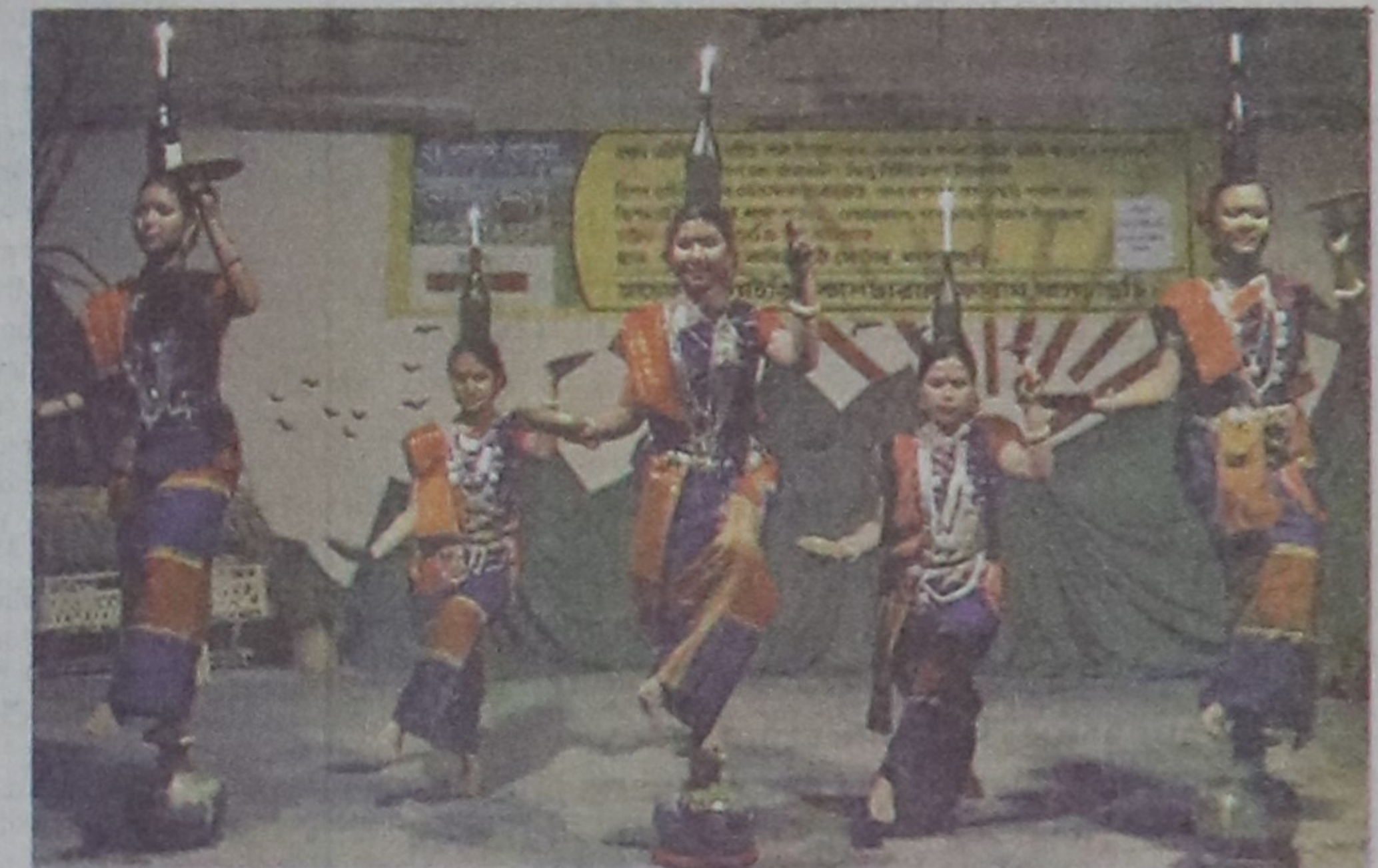
Tripura artistes dance at the programme.