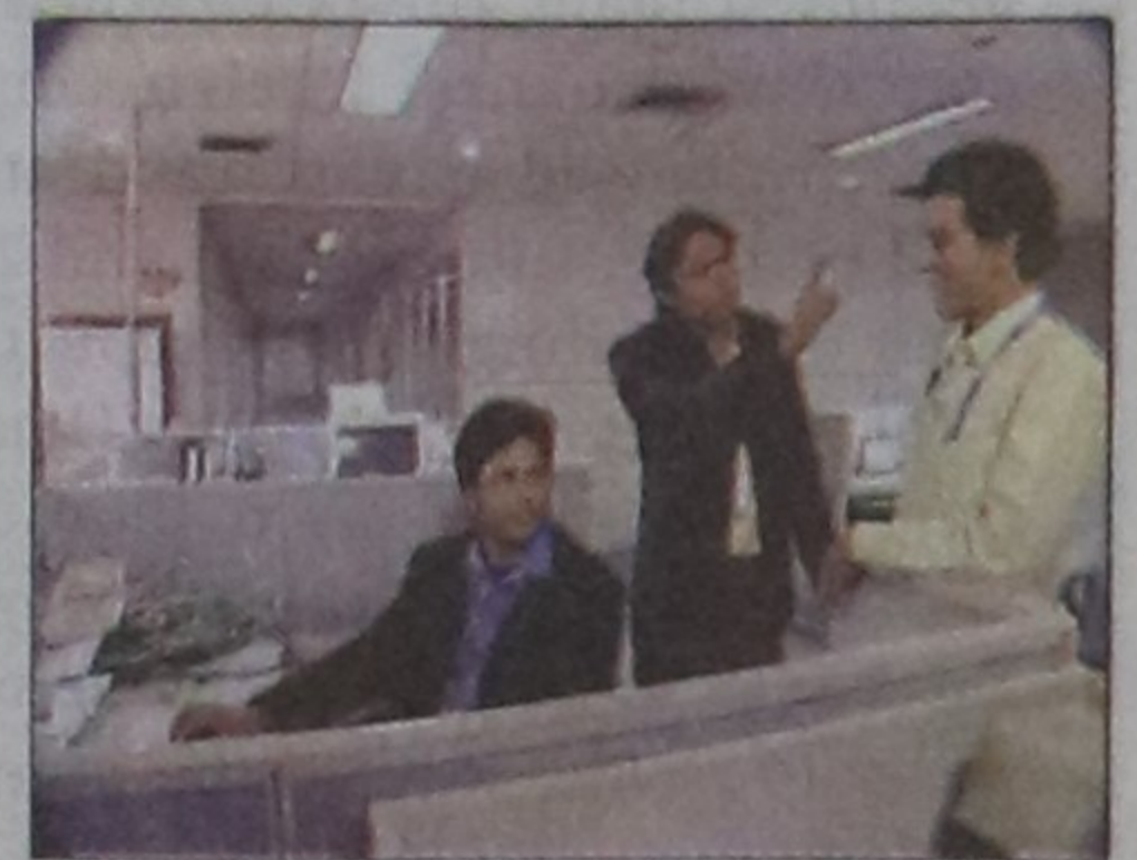
A scene from the serial.