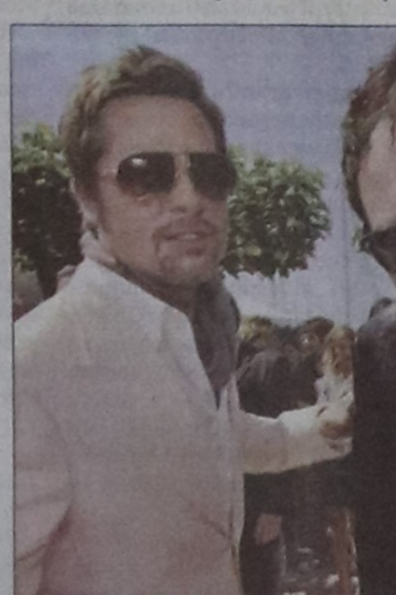
Brad Pitt (left) and director Quentin Tarantino premiered their "Inglourious Basterds" in competition at the Cannes Film Festival.